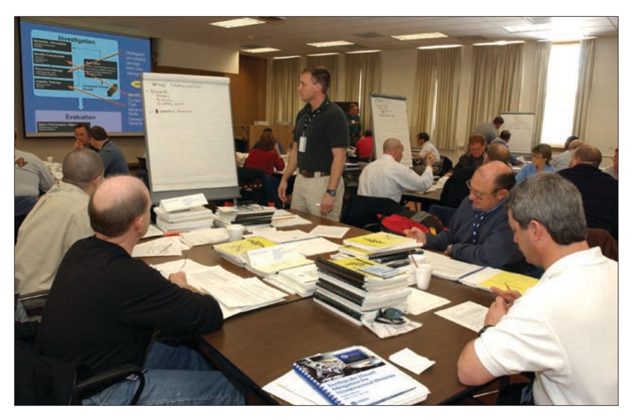
It may be helpful to arrange formal meetings with your experts to ensure that their knowledge, communications skills, and enthusiasm are adequate to help you obtain the support of key professional groups. Also, opposing views among experts can be discussed and evaluated so that disagreements can be resolved or at least clearly explained.

Your own experts may have points of disagreement, given the complexities of the disciplines relevant to seismic safety. But airing those disagreements in public can undermine your case. Prior to making public statements, your experts should identify points of agreement upon which to base your position, and be willing to acknowledge points of disagreement, if necessary.