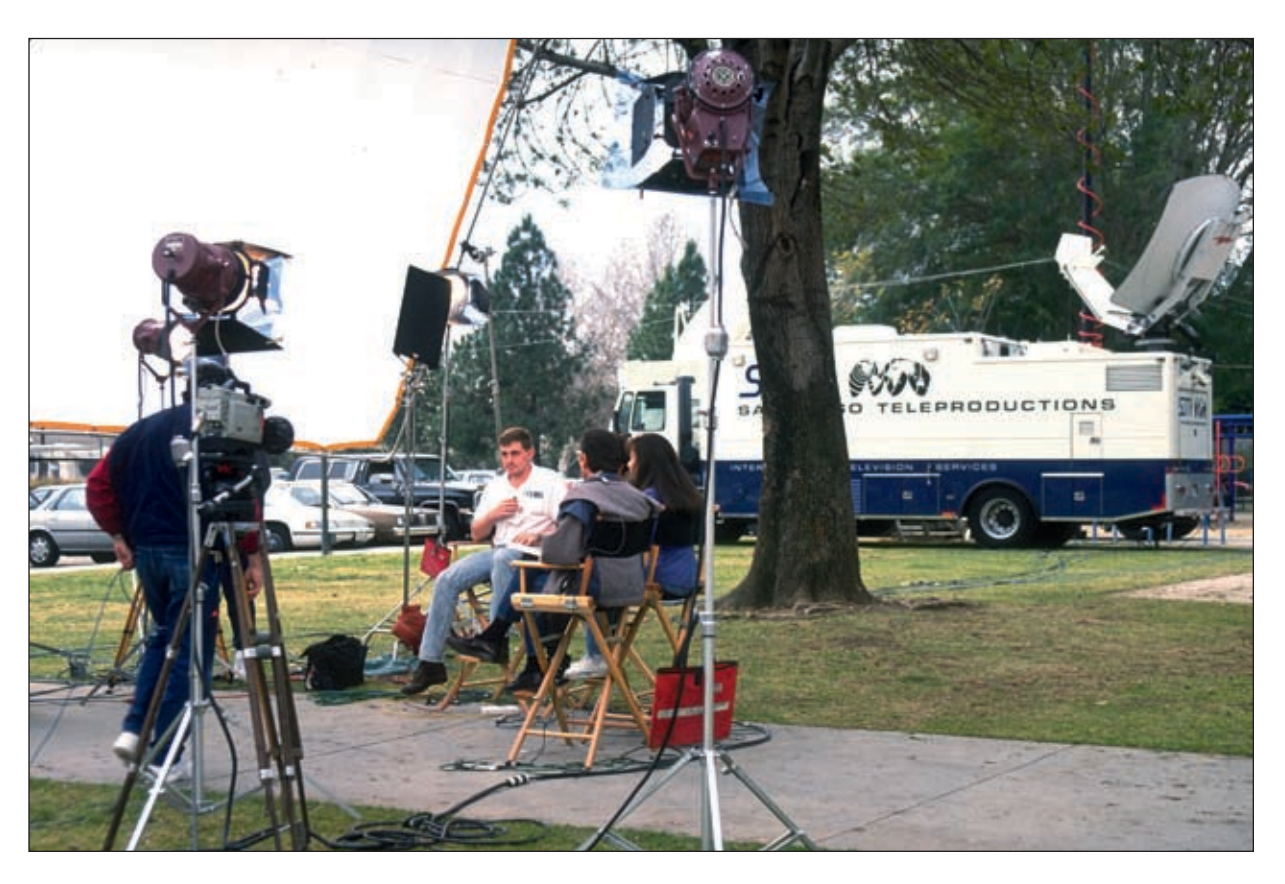
Be prepared to take advantage of opportunities afforded by the media, especially in post-event situations, to present earthquake hazard information and promote seismic safety programs and risk reduction activities that will lessen the affects of future earthquakes.

Establish a timeframe reasonable for different media initiatives, taking into consideration both the time needed to develop media messages and important dates, such as earthquake anniversaries. Divide the labor, assigning responsibility for writing, speaking, arranging media contacts, and other tasks associated with a campaign. Select one or more