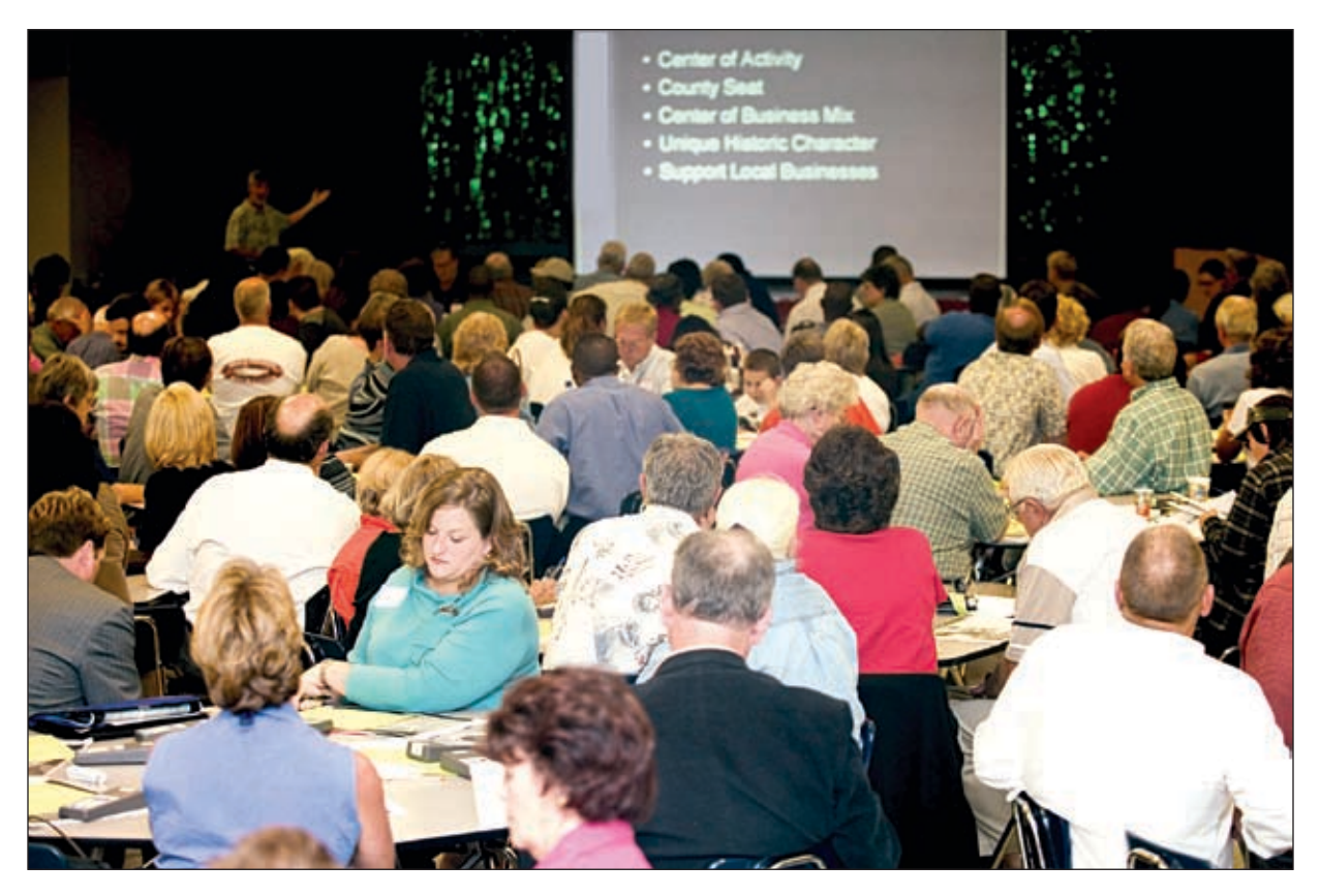
Moderated workshops and presentations can be an effective means of involving, informing, motivating, and maintaining the interest of stakeholders with varying positions on seismic safety measures.

Get to know university-based experts in the earth sciences, the social sciences, and engineering, as well as your local emergency management agency, other key governmental agencies, and important non-profit organizations like the American Red Cross. These ongoing partnerships will help bolster your case for enhancing seismic safety and lend credibility to your efforts.