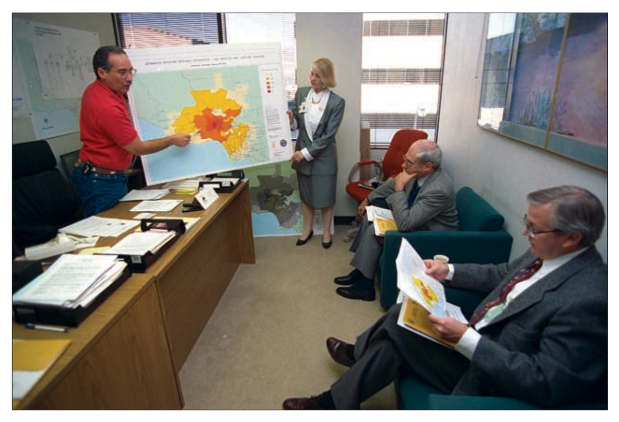
Presentations of earthquake risk information can be made more effective through the use of maps and other visual aids designed to address the specific needs and interests of individual decision-makers.

No individuals or organizations will take action to reduce risk unless they know it exists, they think it may affect them, and they know they can do something about it. Before proceeding to any of the steps outlined below, develop messages for key decision-makers and those who influence them. Tailor all information to each audience's sophistication. To make the messages believable, have them delivered by people who are specialists and/or are thought of as credible by the target audience.