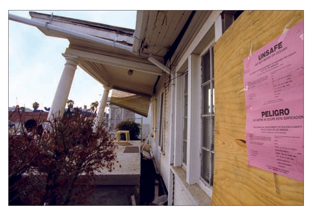
Damage to older woodframe houses has been widespread in recent U.S. earthquakes. Newer woodframe houses built to seismic building codes usually do not have such damage.