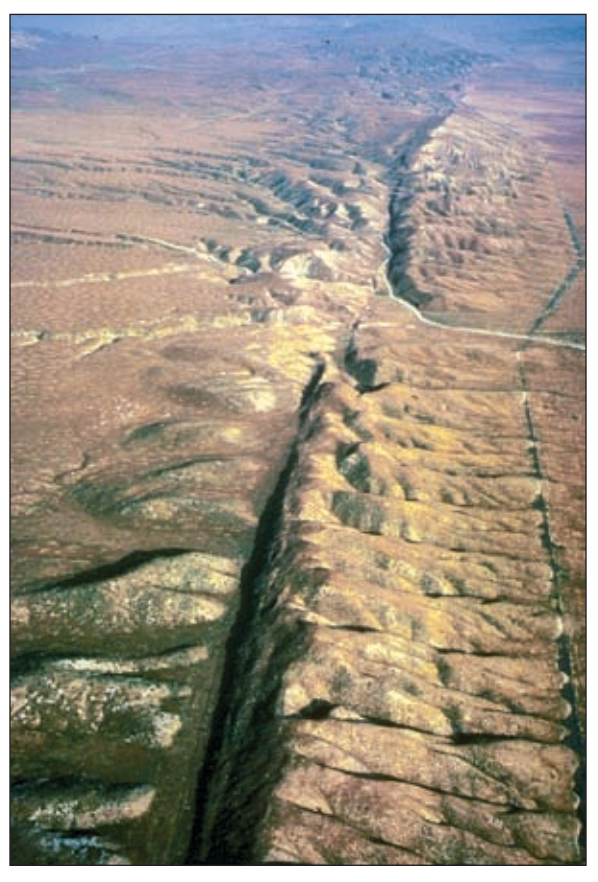
Aerial view of the San Andreas fault in an undeveloped area of the Central Valley in California.

Based on historic earthquakes and evidence of prehistoric earthquakes, seismologists are able to estimate the long-term probabilities of earthquakes in seismically active areas. These estimates, however, are only approximate, because we do not have enough years of records to make statistically reliable estimates. The estimates are useful as a basis for seismic building codes, as well as for comparing hazards between regions, and do give some indication of the likelihood of future damaging earthquakes.