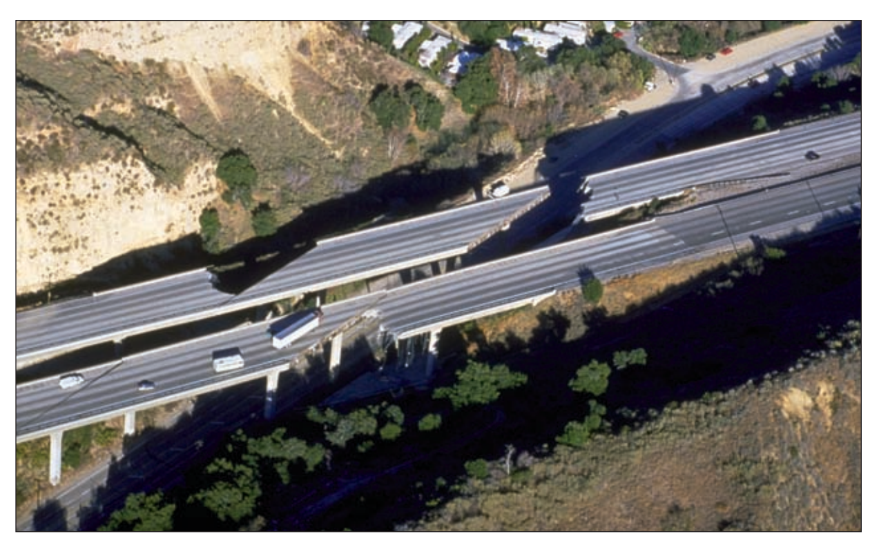
Northridge Earthquake, CA, January 17, 1994 — Many roads, including bridges and elevated highways, were damaged by the 6.7 magnitude earthquake.

occurring sometime in the future, but the truth is that they can happen right now . Because earthquakes occur without warning, communities must be prepared in advance. There are many options for a community. They can take steps to reduce the number of unsafe old buildings or move people out of them. They can adopt codes that ensure new buildings will be earthquake-resistant. They can strengthen vulnerable buildings. They can modernize their infrastructure and make it more damage-resistant. Or they can reduce the financial consequences of damages through insurance.