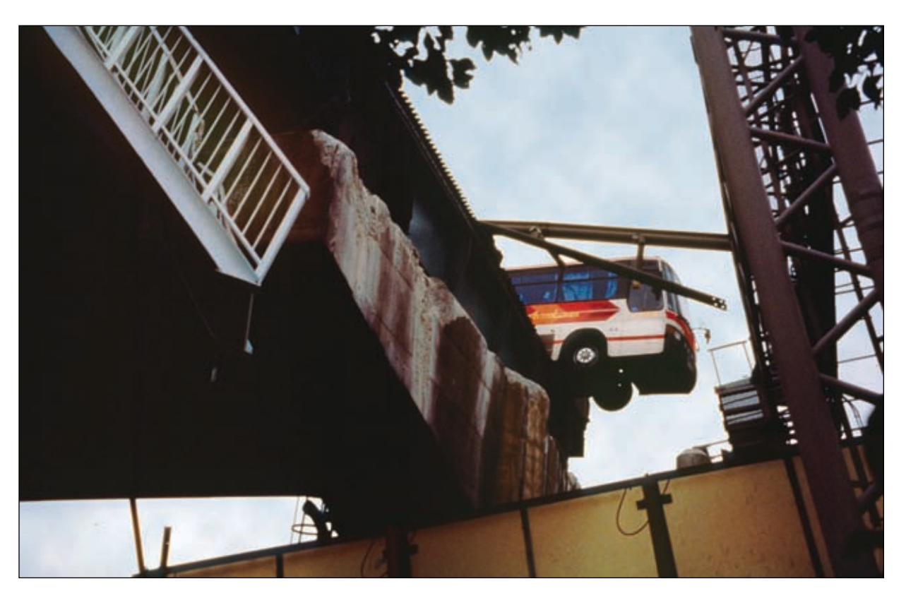
Kobe Earthquake, Japan, January 17, 1995 – A bus filled with holiday skiers stopped just short of disaster on a damaged section of the Hanshin expressway.