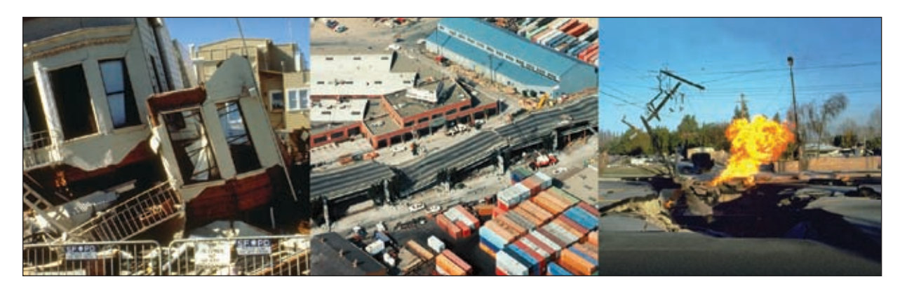
Loma Prieta Earthquake, CA, October 18, 1989 (left to right) – The first story of this three-story apartment building located in the Marina District of San Francisco failed when ground shaking caused liquefaction of the soil on which the structure was built. Fifty-one spans of this double-decker freeway collapsed in Oakland, killing 41 motorists. Northridge Earthquake, CA, January 17, 1994 – A broken gas line on Balboa Boulevard in Los Angeles caused this fire.