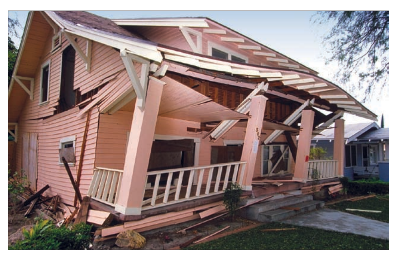
Northridge Earthquake, CA, January 17, 1994 - Buildings and personal property were all destroyed when the earthquake struck.

Angeles because the Nisqually earthquake was extremely deep and did not cause severe shaking at the earth's surface. Earthquakes of similar magnitude can also cause differing levels of damage according to their proximity to populated areas. The 1995 magnitude 6.9 earthquake in Kobe, Japan, was much more devastating than the Northridge quake because the strongest shaking was in the most densely populated areas of Kobe, whereas the strongest shaking in the Northridge quake was under the mountains north of Los Angeles.