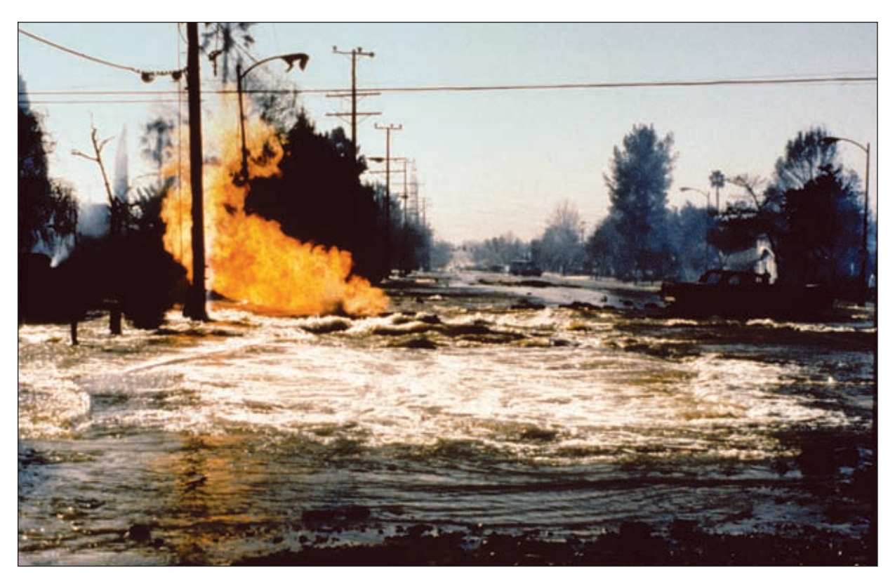
Northridge Earthquake, CA, January 17, 1994 — Broken gas and water mains on Balboa Boulevard in Granada Hills created this scene of fire and flood. The fire burned five homes.