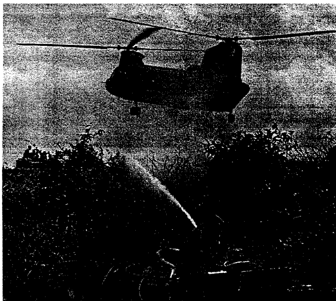
Army file photo of herbicide spraying of a riverbank near a fire support base in Vietnam. (3)