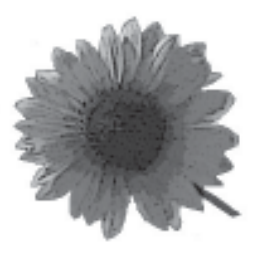
Common Sunflower Helianthus annuus

For information call or write: Tallgrass Prairie National Preserve Attn: Park Rangers Route 1 Box 14, Hwy 177 Strong City, KS 66869