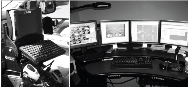
Figure 3: At Left, Mounted Laptop Installed in Border Patrol Vehicle; at Right, Project 28 Command and Control Center