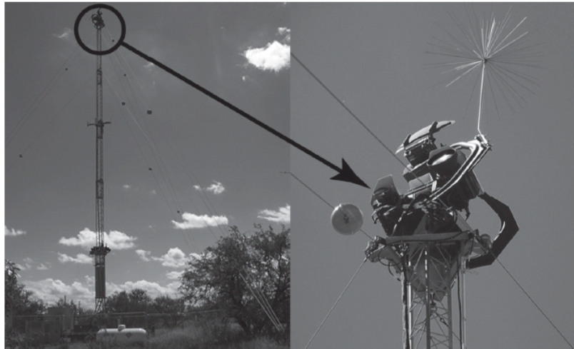
Figure 2: Project 28 Mobile Sensor Tower Deployed in Tucson Sector

DHS announced its final acceptance of Project 28 from Boeing on February 22, 2008, completing its first efforts at implementing SBInet, and is now gathering lessons learned from the project that it plans to use for future technology development. The scope of the project, as described in the task order between Boeing and DHS, was to provide a system with the detection, identification, and classification capabilities required to control the border, at a minimum, along 28 miles within the Tucson sector. To do so, Boeing was to provide, among other things, mobile towers equipped with radar, cameras, and other features, a COP that communicates comprehensive situational awareness, and secure-mounted laptop computers retrofitted in vehicles to provide agents in the field with COP information. As we previously reported, 9 Boeing delivered and deployed the individual technology components of Project 28—such as the towers, cameras and radars—on schedule. 10 See figures 2 and 3 below for photographs of SBInet technology along the southwest border.