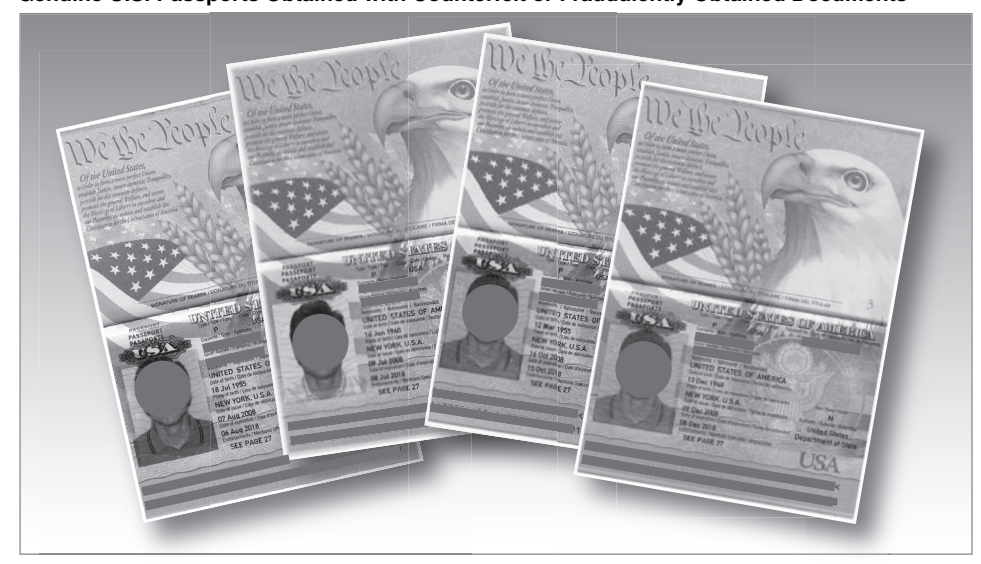
Genuine U.S. Passports Obtained with Counterfeit or Fraudulently Obtained Documents