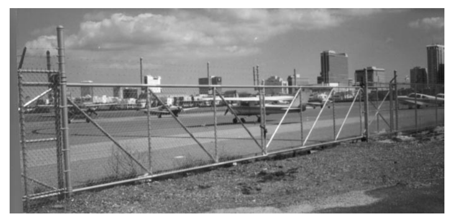
Airport services are limited to parking--there are no fuel, telephone, or restroom facilities within the airport for use by pilots and passengers. Atlantic City skyline is in the background.

Entry to the runway and aircraft parking area, which are surrounded by a chain-link fence. Public notice posted by Atlantic City advising that the airport is "active".