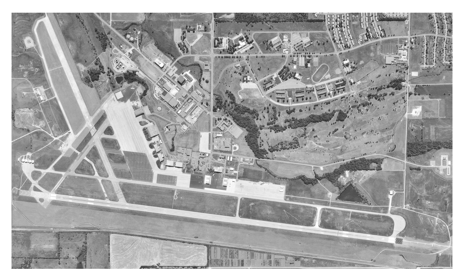
Figure 4: Aerial View of Richards-Gebaur Memorial Airport, Kansas City, Missouri