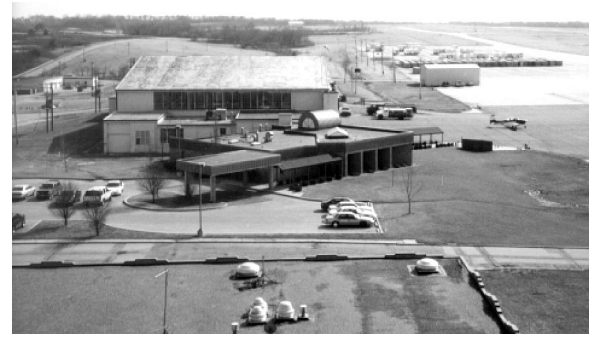
View of the terminal building (front) and aircraft hanger (back and aircraft parking ramp.