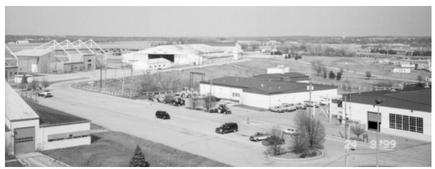
Another view of airport from the air traffic control tower.