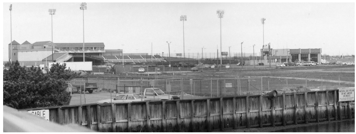
Figure 2: Use of Airport Land at Bader Field, Atlantic City, New Jersey

Minor league baseball stadium surrounded by floodlights. Atlantic City Police Department annex on the right behind the airport runway.