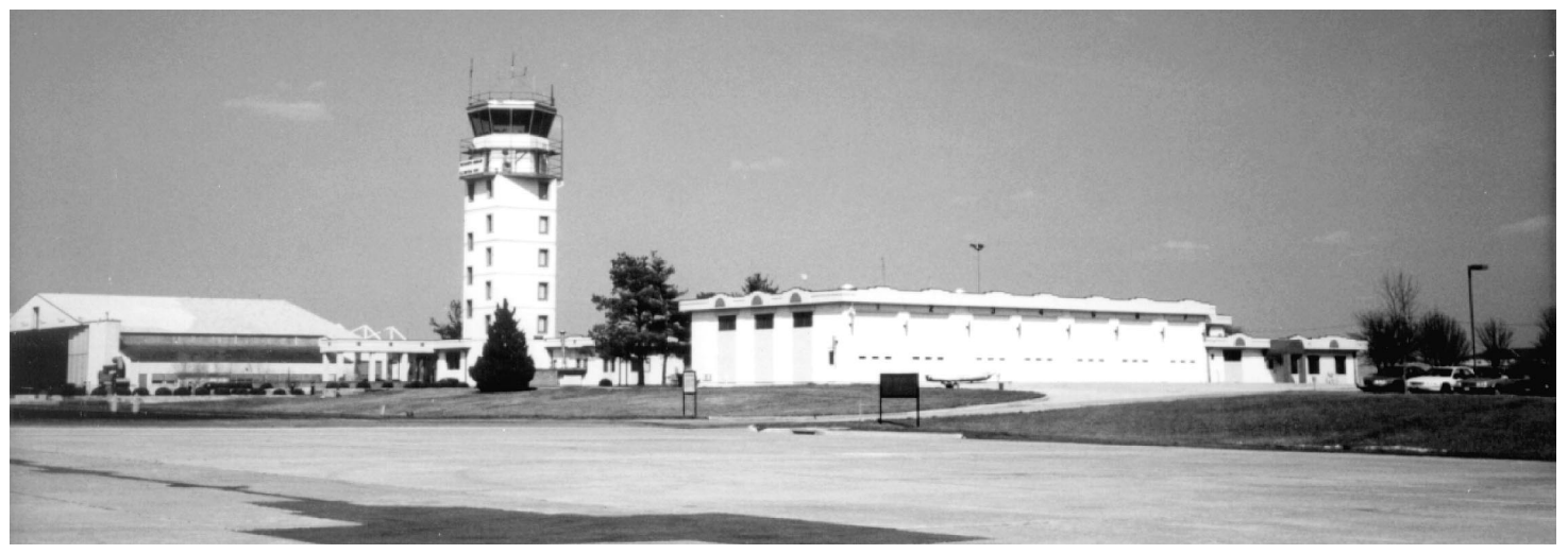
Air traffic control tower, parking area, and hangers.