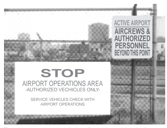
Figure 3: Aircraft Operations Area at Bader Field, Atlantic City, New Jersey

Entry to the runway and aircraft parking area, which are surrounded by a chain-link fence. Public notice posted by Atlantic City advising that the airport is "active".