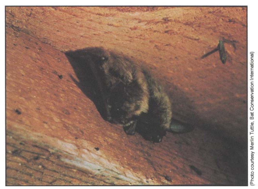
Long-eared myotis (Myotis evotis).

Roost sites and capture locations for all bat species occurring in Oregon have been mapped in relation to habitat and physiography (Maser and Cross 1981). Data on bat distribution were collected from 1970 to 1980 by using mist nets, shooting, and collecting bats from day and night roosts. Range maps of Oregon bats were compiled from this data and previously published accounts.