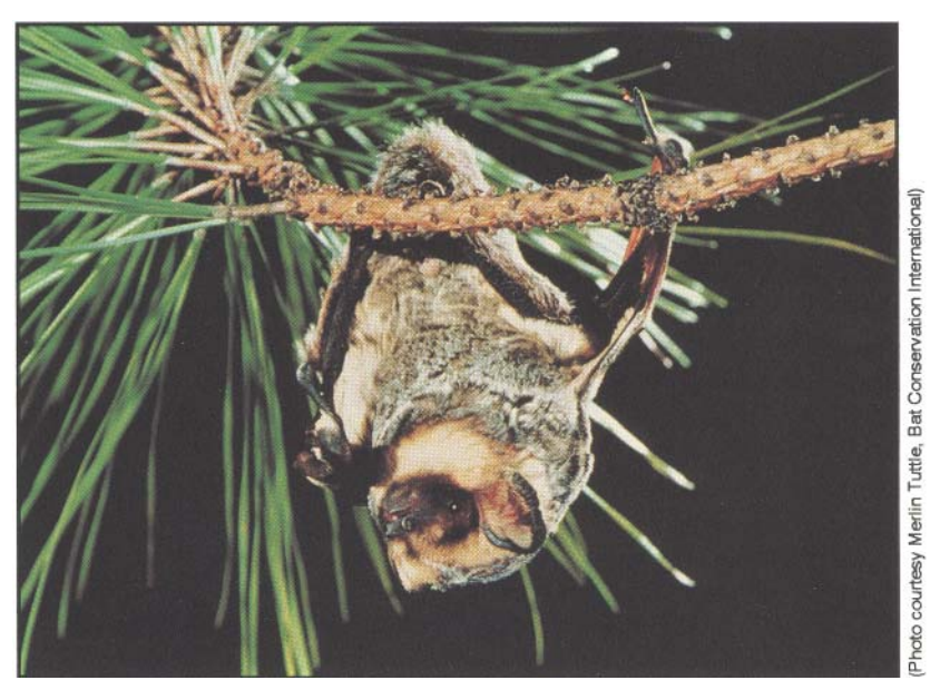
Hoary bat (Lasiurus cinereus).

extremely sensitive to disturbance while roosting, because they hang directly from the ceiling of the roost and do not go into torpor during the day in summer colonies (Barbour and Davis 1969, Dalquest 1948). The hoary bat is the only foliage-roosting bat in the Pacific Northwest and, unlike other species, is not known to roost in human-made structures (table 2). In the Midwest and Eastern United States, hoary bats roost in the foliage of deciduous or coniferous trees and choose sites that are 3 to 12 meters above the ground, open from below, well covered above, and near a clearing (Constantine 1966, van Zyll de Jong 1985). Roost sites have not been found in Douglas-fir forests of the Pacific Northwest, but it has been hypothesized that roost requirements are best met in conifer forests older than 100 years (Perkins and Cross 1988). Older conifers have foliage that begins 10 to 20 meters above the ground and needles that are concentrated around the edge of the canopy, which together provide the proper combination of shelter, open space, and accessibility required by hoary bats for roosting (Perkins and Cross 1988).