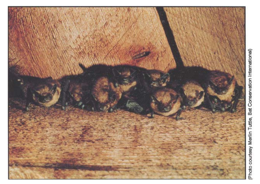
Big brown bats (Eptesicus fuscus).

hunting in structurally complex habitats. Low-frequency calls carry longer distances and are efficient in open habitats. There is a rough correlation between the size of bats and the frequency of their echolocation calls; small bats tend to use high frequencies and large bats, low ones. In addition, the echolocation calls of some species have sufficiently unique shapes (patterns of frequency per time) that they can be used to identify individual species. The pattern of the echolocation call for a given species also varies, however, depending on its purpose; for example, as a bat approaches a prey item, the pulse rate of the echolocation call becomes very rapid, thereby creating a sound called a "feeding buzz." Researchers can use the number of feeding buzzes as an index of foraging activity in different habitats.