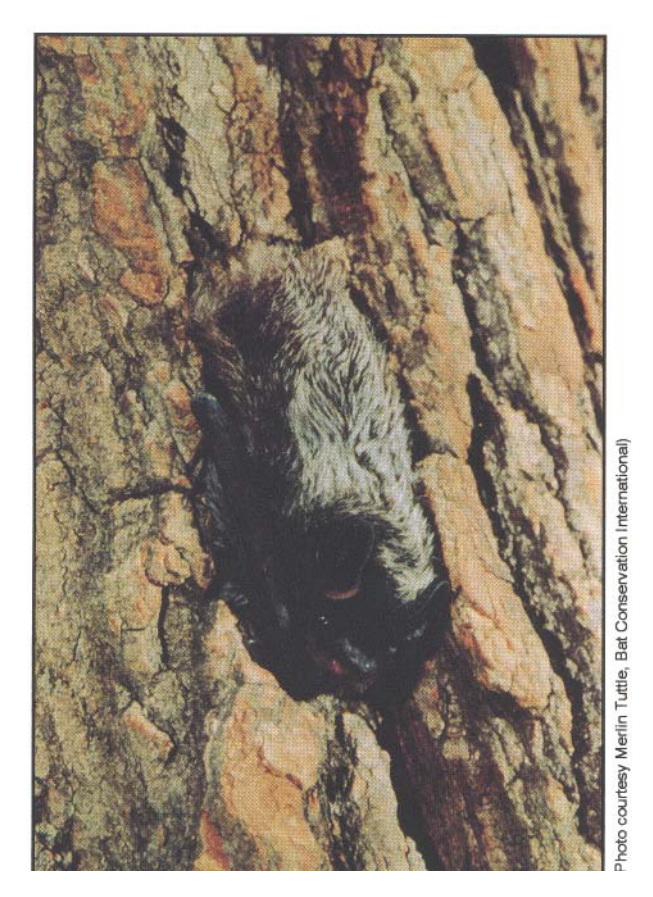
Silver-haired bat (Lasionycteris noctivagans).