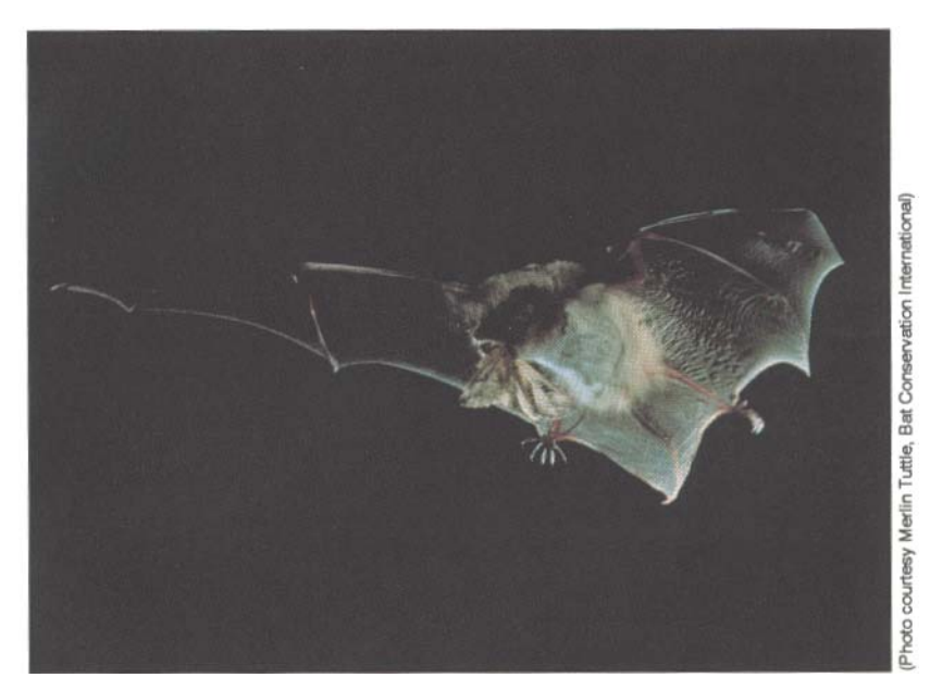
Yuma myotis (Myotis Yumanensis).

Mitigation for the effects of forest harvest on bat populations is difficult to prescribe because critical aspects of their basic ecology are poorly understood. Conservation of bat species in the Pacific Northwest should center on preserving suitable roost sites and foraging areas, but attaining this goal is hampered by our rudimentary knowledge of these requirements. Recent advances in miniaturization of radiotelemetry components have now made radio tracking of bats feasible. This technique holds promise for gathering significant new information on roost characteristics and home range sizes. Three studies involving radio tracking of Myotis bats currently are underway in Washington State. They should provide significant new information on natural roost sites in second-growth and old-growth forests of the Pacific Northwest. Although radio-tracking studies are expensive and time consuming, they are the only practical means of gathering information on roosting behavior in forest-dwelling bats. More studies of this kind are necessary.