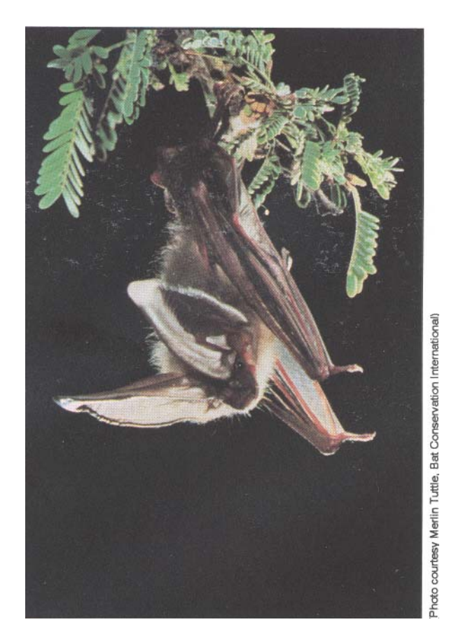
Townsend's big-eared bat (Plecotus townsendii).

big brown and silver-haired bats) may be seen well before sunset but generally emerge just at dusk. Late emergers (long-eared myotis; Townsend's big-eared and hoary bats) usually appear from 30 minutes to 1 hour after sunset (Maser and others 1981, Whitaker and others 1977). Emergence times for the western small-footed and fringed myotis in the Pacific Northwest are not known, but information from other parts of the country indicates that western small-footed myotis emerge early (just after sunset) and fringed myotis emerge late (1-2 hours after sunset) (Cockrum and Cross 1964, 1965; van Zyll de Jong 1985; Woodsworth 1981).