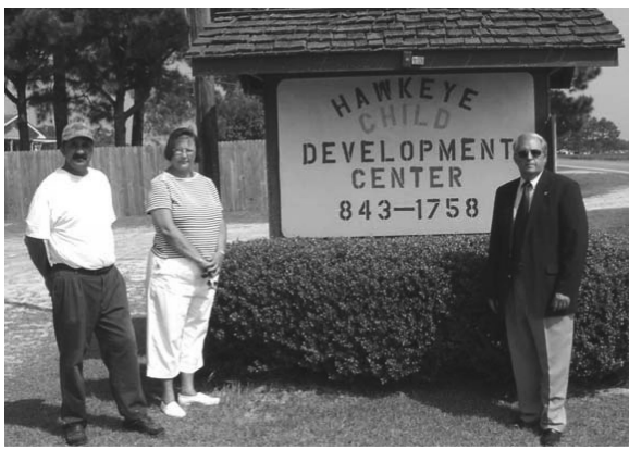
Hawkeye Child Development Center Hoke County