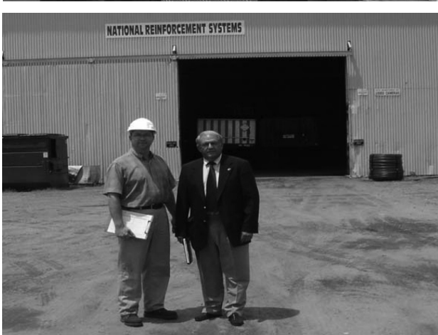
National Reinforcing Systems Robeson County