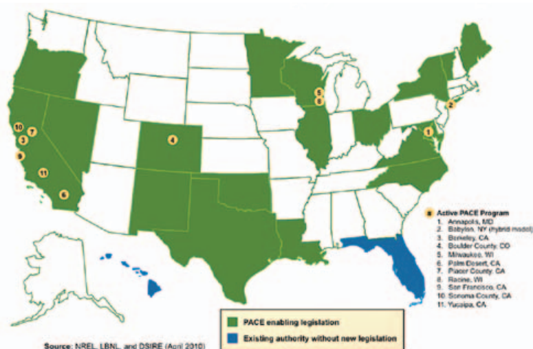
Figure 2. PACE legislation and programs in the United States

The interagency working group responsible for the report recommended providing program guidance to local government financing programs to address the financing barrier. The U.S. Department of Energy is also supporting PACE financing programs through technical assistance, webinars, and online resources for American Recovery and Reinvestment Act grantees that are pursuing long-term financing mechanisms for energy retrofits. 5