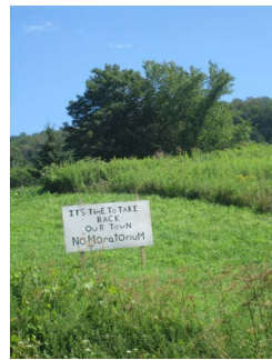
Early engagement and community research can help to identify local champions, an important component of any successful mitigation strategy. (PIX#17248)