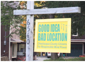
Local opposition to wind power projects has emerged as a market barrier and is likely to become increasingly important as wind energy's footprint grows. (PIX#17247)

Historical barriers to wind power include cost and reliability. However, rapid growth has increased the footprint of wind power in the U.S., and some parts of the country have begun to observe conflicts between local communities and wind energy development. Thus, while questions of economic viability and the ability of grid operators to effectively manage wind energy have become less significant, community acceptance issues have emerged as a barrier to wind and associated transmission projects. Increasing community acceptance is likely to be a growing challenge as the wind industry seeks electricity sector penetration levels approaching 20%.