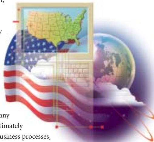
Charles O. Rossotti Commissioner, Internal Revenue Service

A handwritten signature in black ink that reads "Charles O. Rossotti". The signature is fluid and cursive, with a long horizontal line extending from the end.