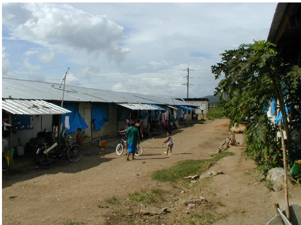
Figure 4: Temporary Shelters in El Progreso Compared to Housing Completed With Disaster Recovery Funds in El Pataste, Honduras