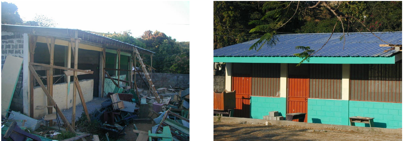
Figure 6: School Under Repair Near La Ceiba, Honduras