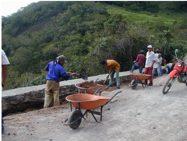
Figure 7: Construction of Retaining Walls and Culverts Near Jinotega, Nicaragua