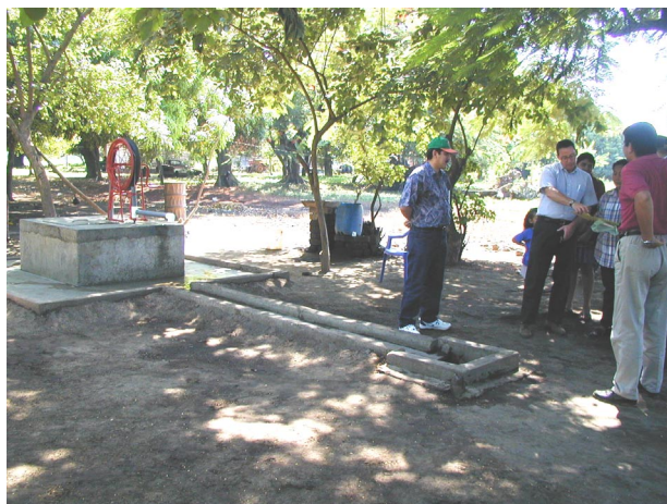
Figure 8: Well Sites in Rural Nicaragua