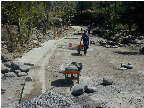
Figure 2: Cobblestone Road Project in Pespire, Honduras