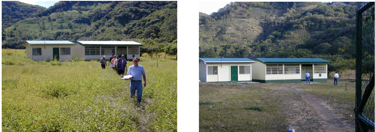
Figure 12: Rural Health Facility Near Matagalpa, Nicaragua

lack of support. In January 2001, we returned to the clinic unannounced and found that a doctor was present and living at the residence and the clinic was operating. He had been assigned following our earlier visit. (See figure 12.)