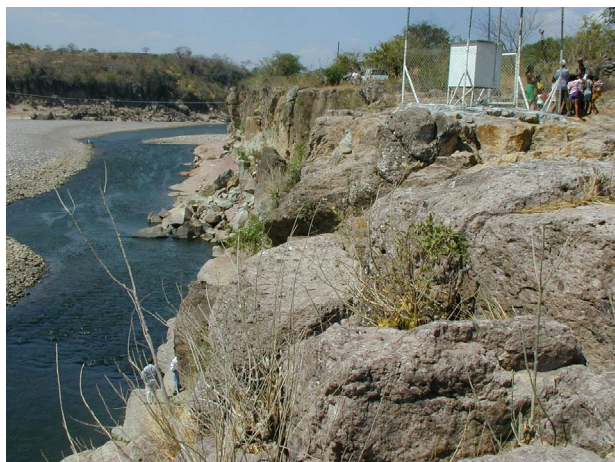
Figure 5: River Gauge Near Choluteca, Honduras