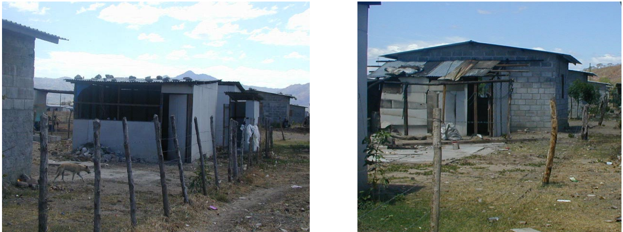
Figure 10: Houses in Limon de la Cerca, Honduras

Twelve nongovernmental organizations representing a variety of international donors built 1,126 houses for families who lost their homes in Mitch floods. USAID funded a temporary health clinic and a vocational training center. USAID is also funding a potable water and sewer system for the planned community; the residents have a temporary water supply and latrines in the meantime. However, because such services are not complete or are inadequate to support the community, many houses remain unoccupied and some families have moved elsewhere. Crime is increasing and some residents are stealing materials from unoccupied houses. According to USAID officials, these problems stem partly from the rush of donors to finish houses and the fact that community leadership has been divided among the different areas developed by nongovernmental organizations, with the unintended result of setting up separate communities. (See figure 10.) USAID is optimistic that the community will become more viable as more families move in following completion of the water system and the rest of the houses. However, USAID officials also noted that experienced developers are needed for these large sites to help ensure that attention is paid to overall infrastructure and services.