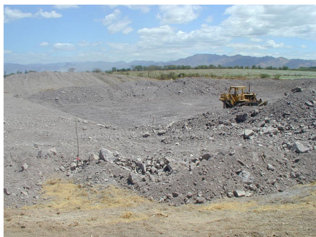
Figure 9: Construction of Sewage Treatment Lagoons Near Choluteca, Honduras