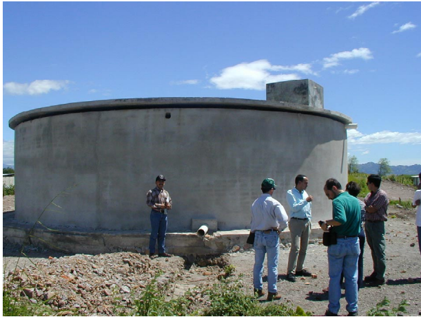
Figure 3: Water and Sanitation Projects Near Choluteca, Honduras