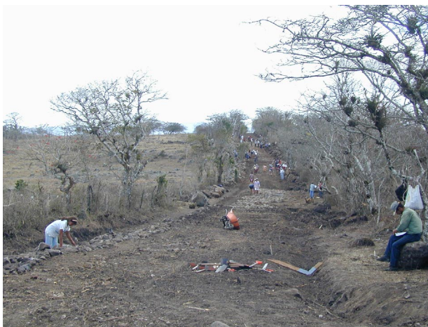
Figure 11: Rural Road Near Jinotega, Nicaragua