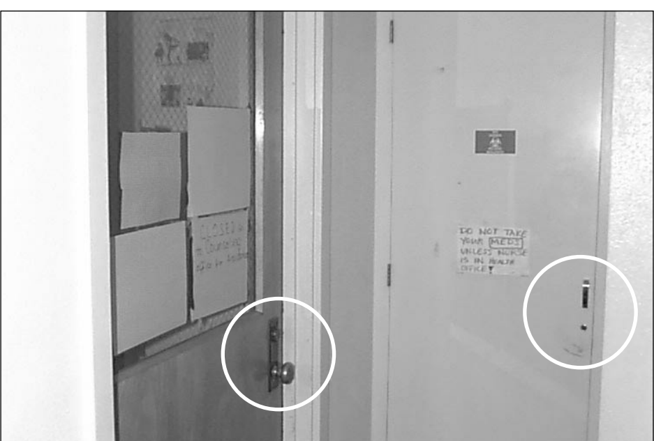
Cabinet and door locks school B