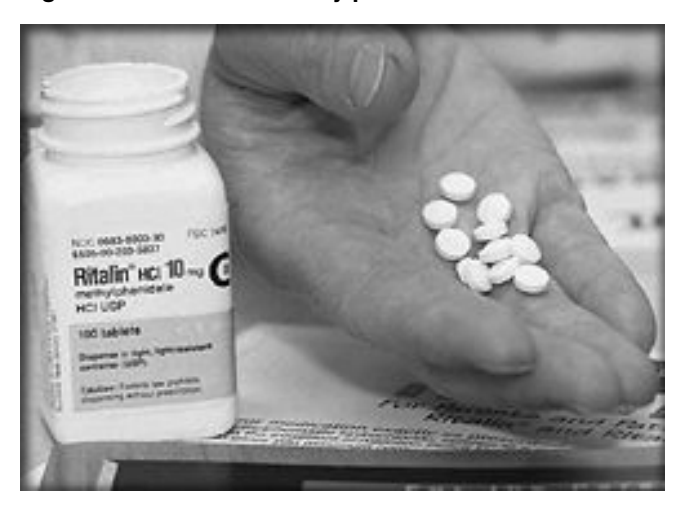
Figure 1: Brand Name Methylphenidate Pills