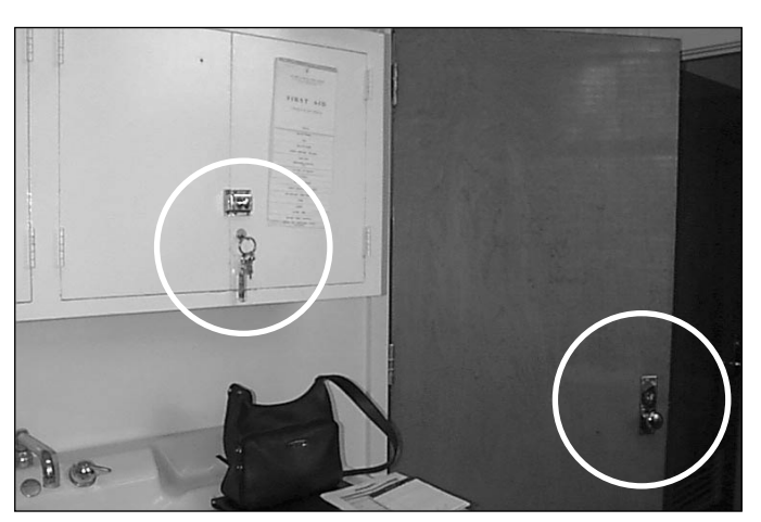
Cabinet and door locks at school A