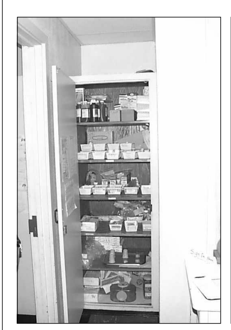
Medication in cabinet at school B