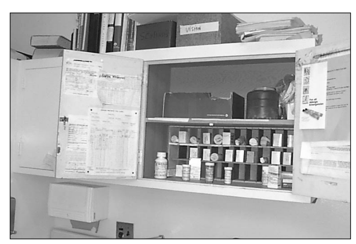
Medication in cabinet at school A