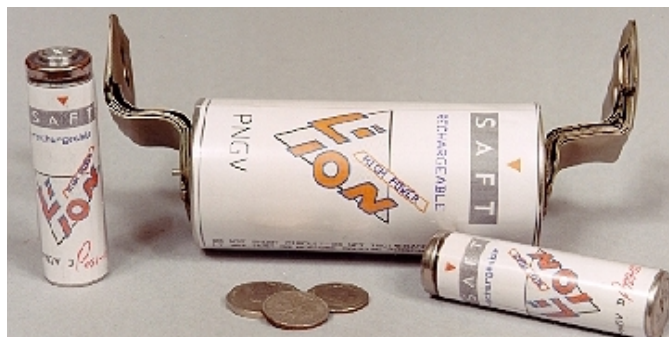
Exhibit 1: SAFT Li-ion high-power battery.