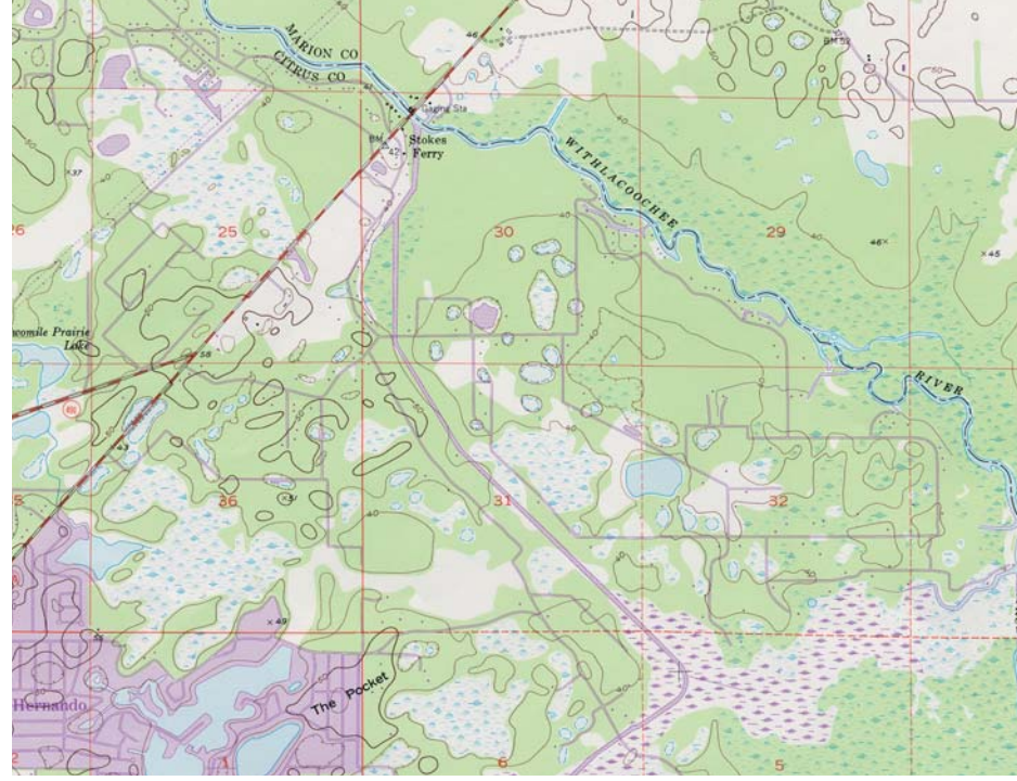
Withlacoochee River Watershed

The Watershed Management Initiative covers the Withlacoochee River watershed and its adjacent coastal waters.