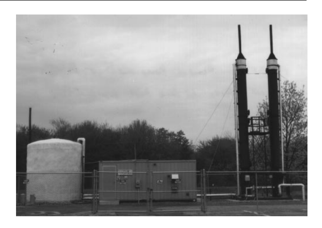
Figure 3.1: Groundwater Pump-and-Treat Pilot Project, Pease Air Force Base, New Hampshire

Pump-and-treat systems may need to be tested over several years to determine their effectiveness. For example, at two installations we visited, Norton and George Air Force Bases in California, pilot systems were in place, but officials said they were operating at about one-half of the capacity because the groundwater did not flow as expected. They said the number of wells for these systems will need to be increased for sufficient water to flow, and even if successful the systems may need to operate for 30 years or more. At Norton Air Force Base, groundwater contamination extends from the central base area, toward the southwest in the direction of groundwater flow beneath the base, and continues beyond the base boundary. There are several community water wells near the base within the anticipated path of the contaminants.