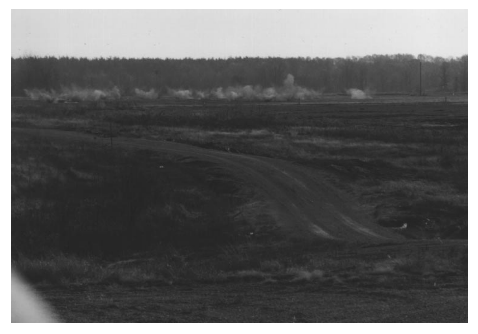
Note: The smoke in the upper center of the photograph is from the impact of live munitions.

According to Army ordnance and other officials, new and more cost-effective technology needs to be developed for cleaning up the unexploded ordnance. A study at the Army's Jefferson Proving Ground, which has extensive quantities, types, and dispersion of unexploded ordnance, found that the cleanup effort would be labor intensive. For example, the work would require using metal detectors for the majority of