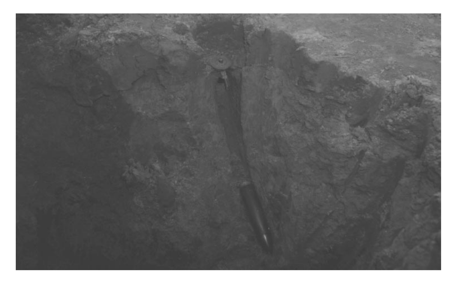
Figure 3.4: Item of Unexploded Ordnance Found Buried on the Army's Jefferson Proving Ground Range

land, mapping the unexploded ordnance, handling or removing it, and disposing of it. Because the installation potentially has 51,000 contaminated acres and is heavily forested, current cleanup technology is not practical or affordable. Although the cleanup plan included $216 million in estimated costs, the plan noted that costs could run to $2 billion a year for several years, and officials said other estimates for cleanup have ranged from $5 billion to $8 billion in total, depending on how the property is to be reused. Figure 3.4 shows an example of buried unexploded ordnance.