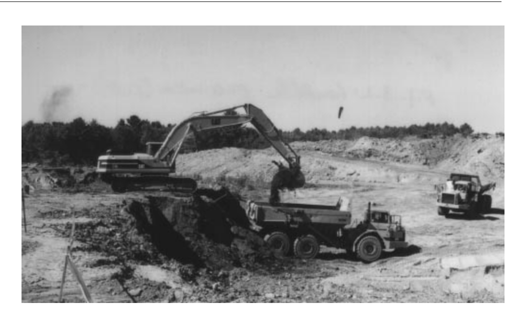
Figure 3.2: Landfill Excavation (below) and Soil Removal Project (page 30), Pease Air Force Base, New Hampshire.