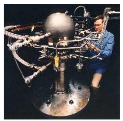
Figure 4. CTPC Being Readied for Test at MTI.

to provide the gas film to support the piston, and thus non-contacting operation was achieved. A similar arrangement was used on the displacer. This gas bearing system was successfully demonstrated in hardware and achieved non-contacting operation. The CPG design used hydrodynamic gas bearings. This was accomplished using a small electric motor to spin the piston and displacer. Care was taken during the design process such that the close clearances were able to act not only seals, but also as non-contacting hydrodynamic gas bearings. Although this was never demonstrated on the 25 kWe ASCS design, the concept had been successfully demonstrated at Sunpower, Athens, OH<sup>11</sup>.