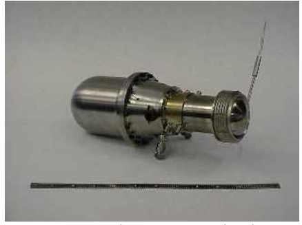
Figure 1 . - The 55-We Technology Demonstration Convertor (TDC).

The free-piston Stirling convertor being developed for this system is the 55-We Technology Demonstration Convertor (TDC), as shown in figure 1. This development effort has been performed by the STC under contract to DOE<sup>6,7</sup>. The TDC successfully achieved the power and efficiency goals set by DOE, and in a dynamically balanced configuration was able to reach vibration levels acceptable for the aforementioned missions. All of the missions for which this power system is being considered require a highly reliable power system, and all of the missions envisioned are multi-year in length.