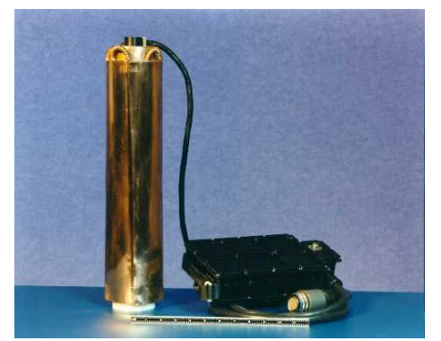
Figure 5 . The 10 We RSG by STC has Over 60,000 Hours of Operation.

Following the vibration test the TDC was operated for another 35 hours (10<sup>7</sup> engine cycles) with no change in performance, and then disassembled and inspected. No effects of the vibration testing were found upon inspection<sup>9</sup>.