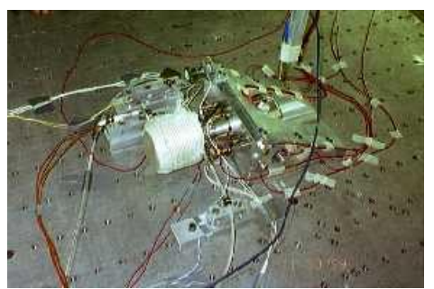
Figure 6 . The TDC Installed for Random Vibration Test Conducted at GRC.

Similar applications of flexure bearing technology can be found in the aerospace Stirling cycle cryocoolers<sup>12</sup>. Long life operation of these flexure based cryocoolers has also been demonstrated with multiple demonstrations into the 20,000 and 30,000 hour range 12,16,17,18. There are several issues involved in obtaining long life with the application of flexures. One is to clearly understand the state of stress in the flexure, the fatigue limits of the material, and thus the margin of safety. Beyond this, there are details in the design, fabrication, inspection, and installation of flexures that are critical. These factors may be addressed somewhat differently by each company based on their specific experiences. The common finding by the various users of flexure technology for linear oscillating machines is that when designed, fabricated, and installed correctly, they are capable of providing essentially infinite life.