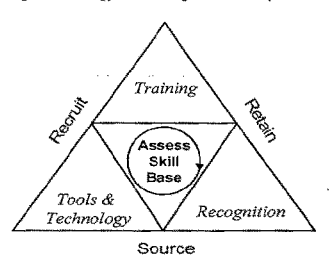
Figure 1: Strategy for Securing IT Human Capital in Leading Organizations

Leading organizations assess their IT skills on an ongoing basis to determine what expertise is needed to meet current responsibilities and support future initiatives. Needed skills are compared with existing capabilities in the organization to determine gaps in the IT skills base. Strengthening IT skills and capabilities identified in the gap analysis is addressed though training and innovative hiring practices as part of a formula for building information technology and management capabilities. Further, we found effective CIO organizations cultivate expertise in their internal workforces while outsourcing skills that are available from multiple sources at lower cost. In short, effective staffing and sourcing strategies provided the organizations we studied with dynamic, flexible workforces that can execute IT management functions to meet changing business needs and priorities.