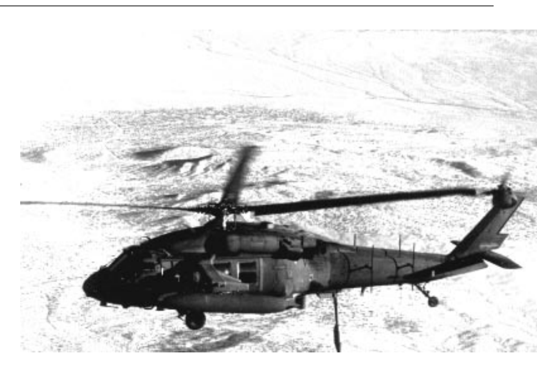
Figure 3: Advanced Quickfix