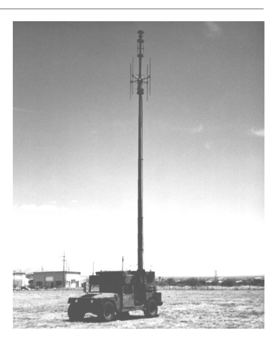
Figure 1: Ground Based Common Sensor-Light