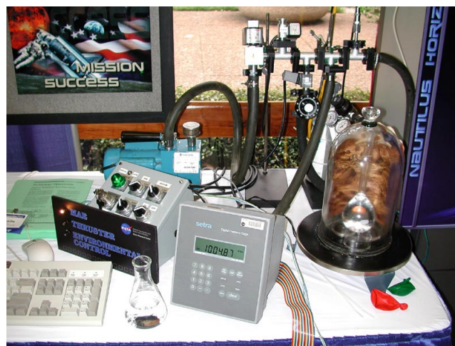
Figure 2.—Mars Surface and Atmosphere Experiment.

The extended wireless network interfaced with the demonstration area's 10BaseT network, which emulated the payload network aboard the space station. The payload used for this demonstration was the Mars Surface and Atmosphere Experiment (see fig. 2). This experiment was developed by the NASA Glenn Flight Software Engineering Branch to demonstrate how EWT can lower mission costs and simplify operations by using standards-based protocols to command and control the future experiments.