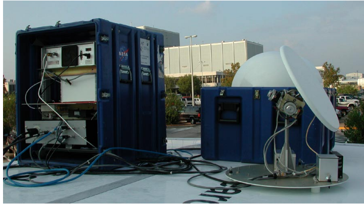
Figure 1.—Tracking and Data Relay Satellite System Internet Link Terminal.

To emulate a ground-to-space network, the NASA TDRSS was chosen because it is the primary satellite system that provides NASA data communications for NASA missions. Modifications were made to the NASA White Sands TDRSS ground station to provide an Internet gateway to NASA TDRSS. The emulated space-based side of the network used the portable S-Band satellite terminal, developed at the NASA Goddard Space Flight Center, known as TILT (TDRSS Internet Link Terminal) which is shown in figure 1. TILT was installed at the Johnson Space Center demonstration site to emulate a satellite link onboard the International Space Station. The NASA White Sands TDRSS ground station has been modified to accept the TILT interface. The TILT interface at White Sands receives the <10^{-7} BER link signal from TDRSS. The TILT remote ground station uses COTS (common off the shelf) equipment including COTS routers and INTELSAT-specified satellite modems. The link was capable of providing 1.0 MBPS throughput. This was more than enough bandwidth to effectively conduct this demonstration.