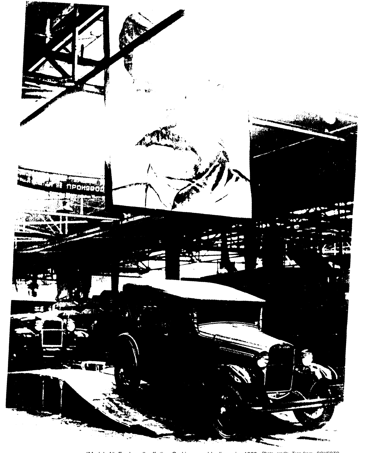
"Model A" Fords roll off the Gorki assembly lines in 1929