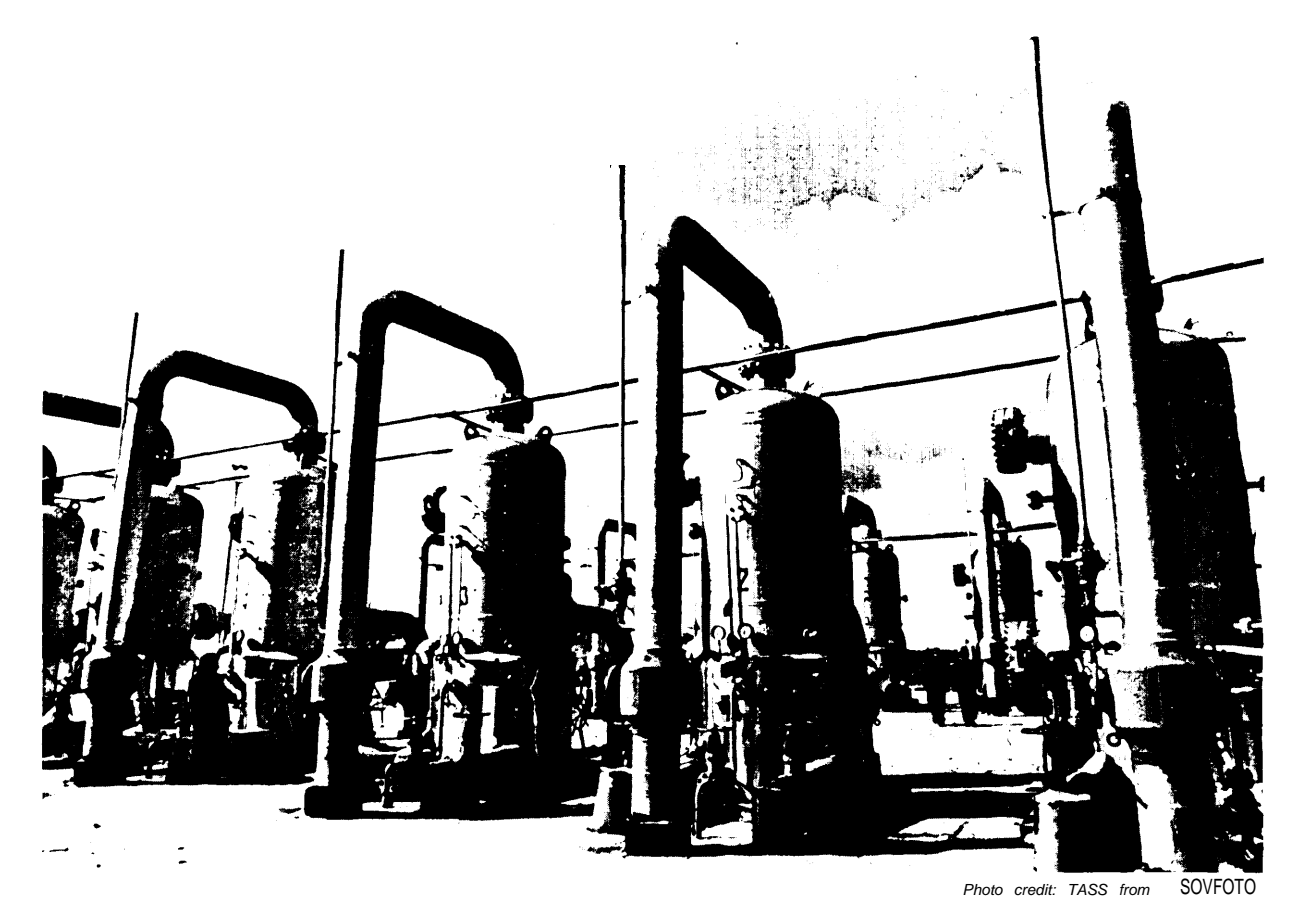
Separation installations at a West Siberian gas compression station

Whatever the cause, the effect of this episode was to reveal an element of discord in alliance relations. The situation was seriously exacerbated by President Reagan's announcement, hard on the heels of Mitterrand's statement, that the United States would extend its foreign policy controls on oil and gas equipment exports to the U.S.S.R. retroactively and extraterritorially, i.e., to cover completed contracts for equipment produced overseas by subsidiaries and licensees of U.S.