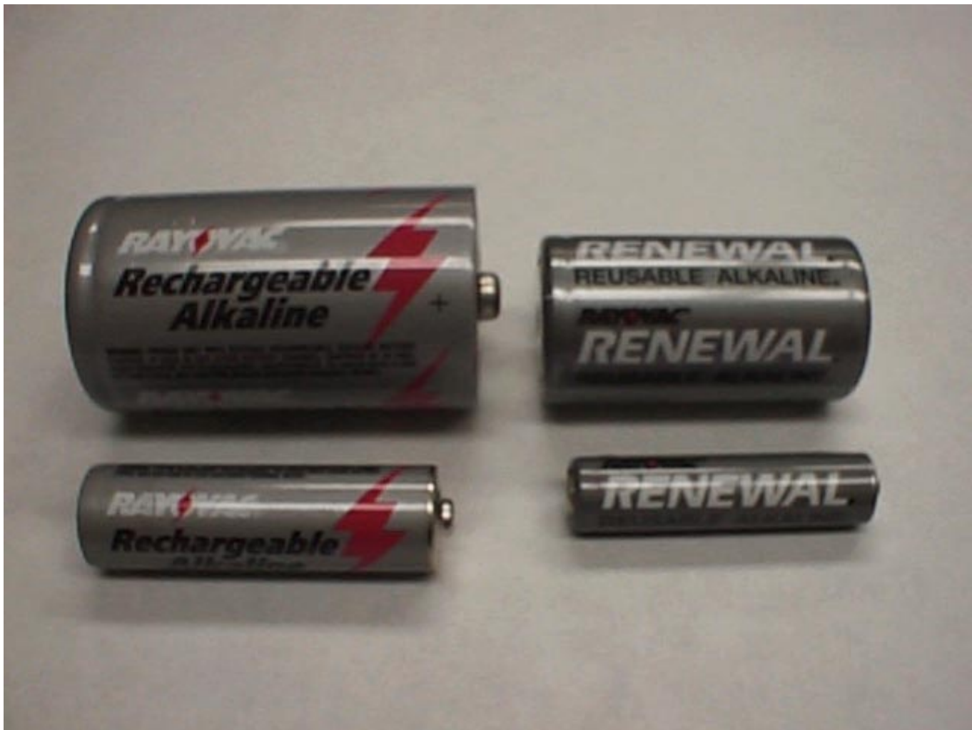
FIGURE 2-1. Rayovac Renewal® Batteries