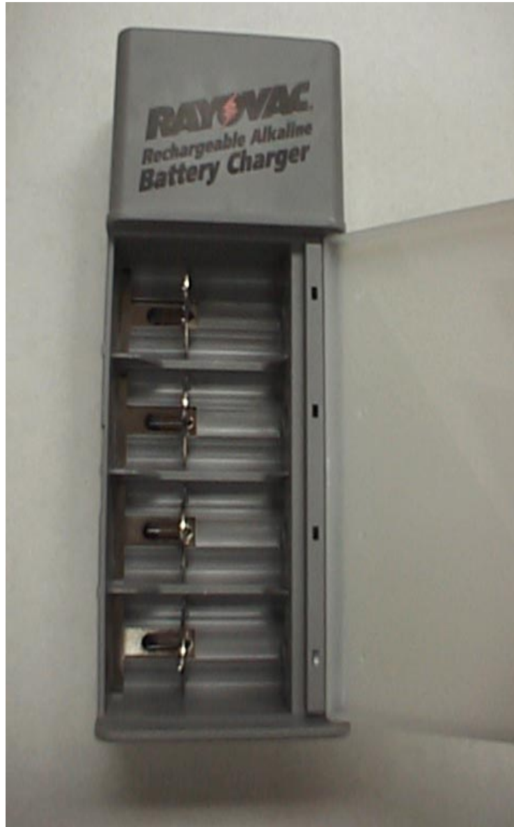
FIGURE 2-2. Rayovac Charging Unit (PS3)