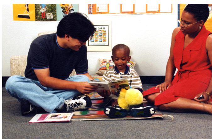
Figure 1: Recruitment Efforts to Attract Young People to the Field of Teaching.