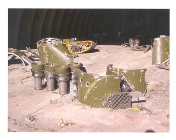
SS-23 Missile Electronic and guidance components destroyed