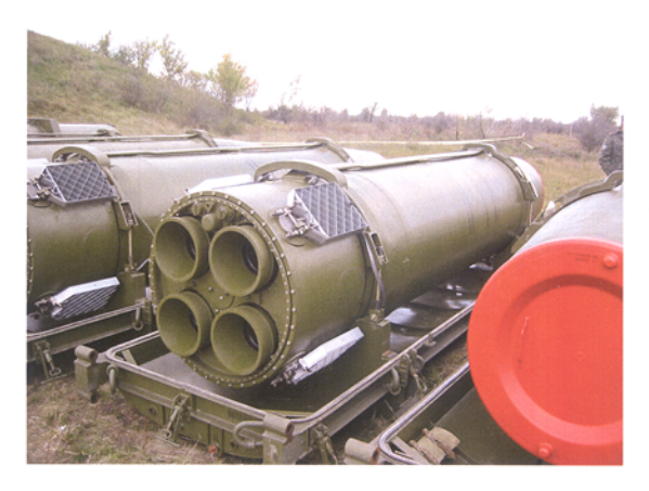
SS-23 Missile Pre-Destruction