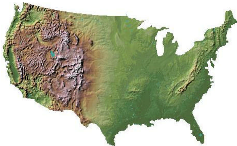
Figure 1: A shaded-relief representation of the conterminous United States portion of the National Elevation Dataset (NED). Elevation is portrayed as a range of colors, from dark green for low elevations to white for high elevations.

The National Elevation Dataset (NED) is a new raster product assembled by the U.S. Geological Survey (USGS). The NED is designed to provide national elevation data in a seamless form with a consistent datum, elevation unit, and projection. Data corrections were made in the NED assembly process to minimize artifacts, permit edge matching, and fill sliver areas of missing data.