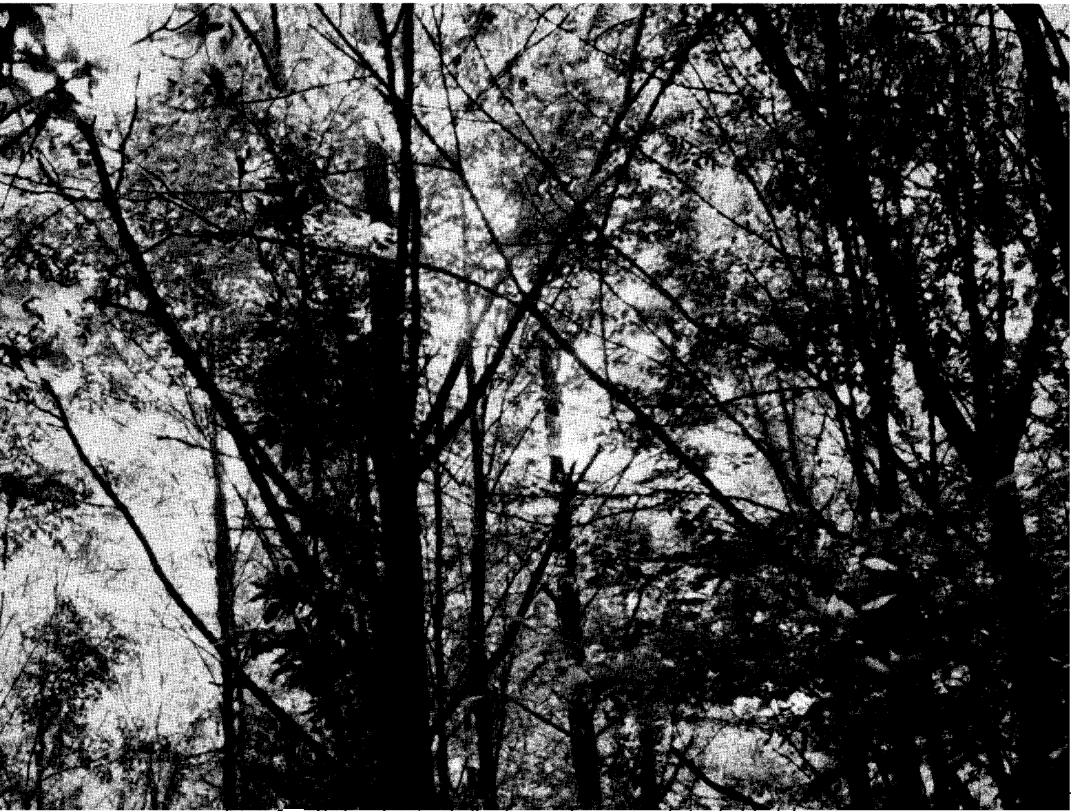
Figure 5.— The branches of sawtooth oak as seen here are persistent and relatively large.

Although sawtooth oak growth and seed production are greater than those of Nuttall oak, stem quality is poorer (fig. 5). Lower limbs are retained longer than those of Nuttall oak, and stem crook is more common . Sawtooth oak has rougher bark than Nuttall oak, and some stem crook or top dieback may be due to greater loads of vines. Sawtooth oak may not be suitable for quality sawlog production without pruning and vine control. However, sawtooth oak is planted primarily as a food tree for wildlife, and thus log quality may be less important than for other oak species.