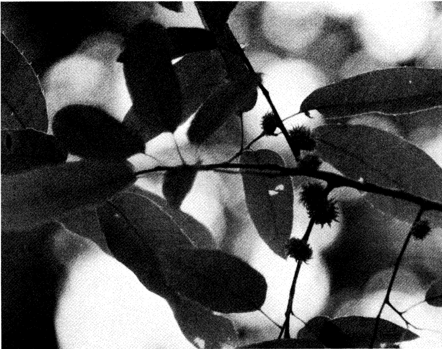
Figure 3. — A branch of a sawtooth oak showing developing acorns. The picture was taken in July.

Almost all sawtooth oaks at both sites were producing acorns (table 1). Ten percent fewer sawtooth oaks were producing acorns 8 years ago ( Francis and Johnson 1985). None of the Nuttall oaks bore developing acorns (table 1). Although Olson (1974) suggests that Nuttall oak may produce acorns as early as age 5, no acorns were observed at age 14 or 22 at the Delta Experimental Forest site. Although no data were recorded for quantity or quality of acorn production, many of the sawtooth oaks possessed large developing crops (fig. 3), and there were numerous sawtooth oak seedlings growing in the vicinity of the plantations.