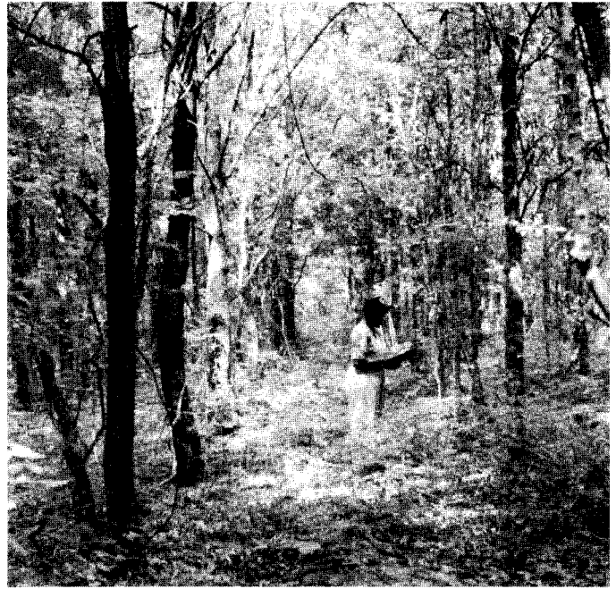
Figure 2.— Theplantation at Delta Experimental Forest, Mississippi, showing sawtooth oak growing on the left and Nuttall oak, on the right.

Sawtooth oak grows much better on the well-drained soil of the Huntington Point site than on the heavy clay soil at the Delta Experimental Forest site (table 1). At Huntington Point, sawtooth oak has grown an average of 4 ft in height per year and 0.45 inch in d.b.h. per year over the last 8 years. Although this represents excellent growth, Shumard oak ( Quercus shumardii Buckl.) grows as well as or slightly better than sawtooth oak on similar well-drained sites (Kennedy and Krinard 1985). Because sawtooth oak performs similarly to these other oak species on two contrasting sites, it would be an acceptable choice on either heavy clays or well-drained soils.