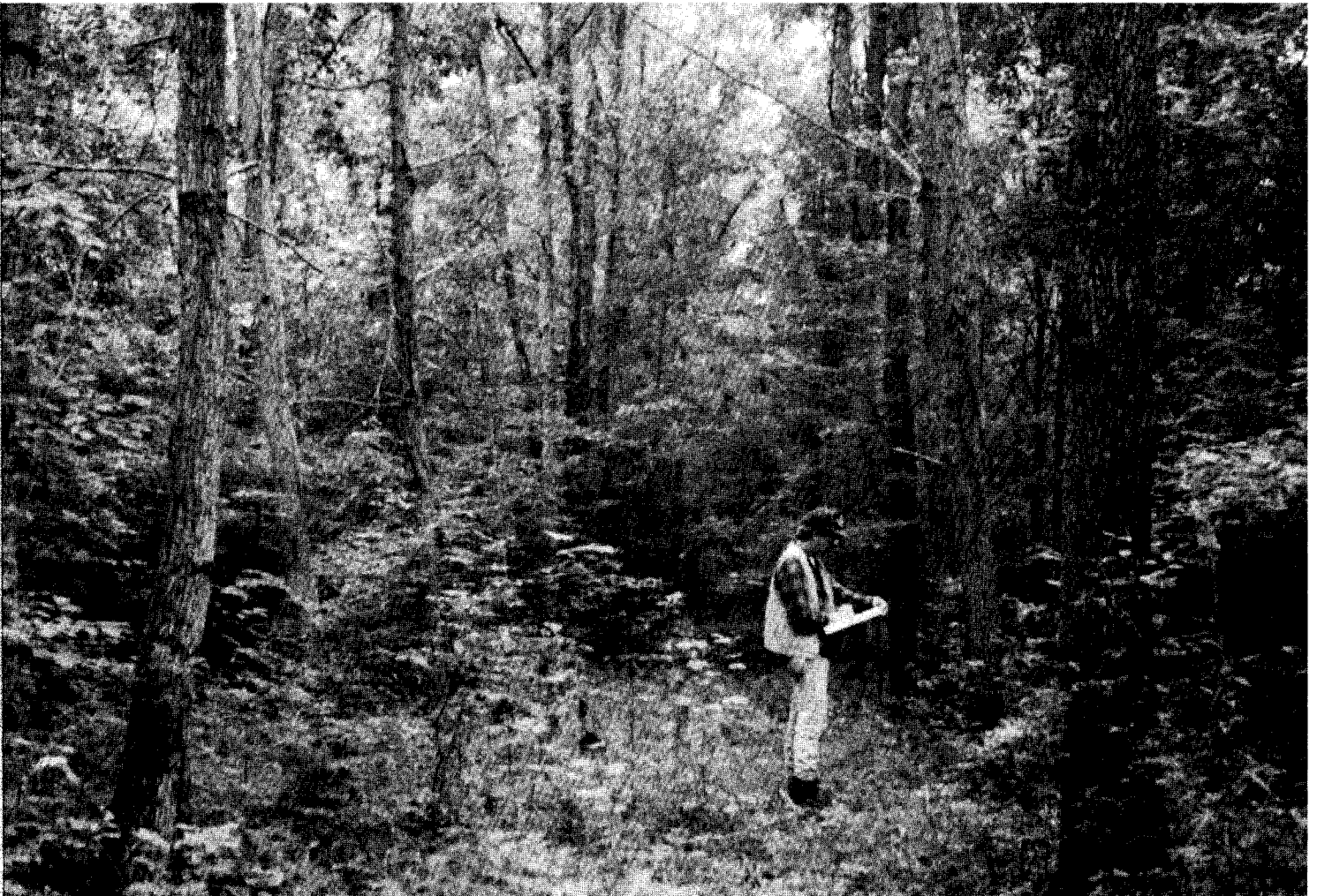
Figure 1.— The sawtooth oak plantation growing at Huntington Point, Mississippi.