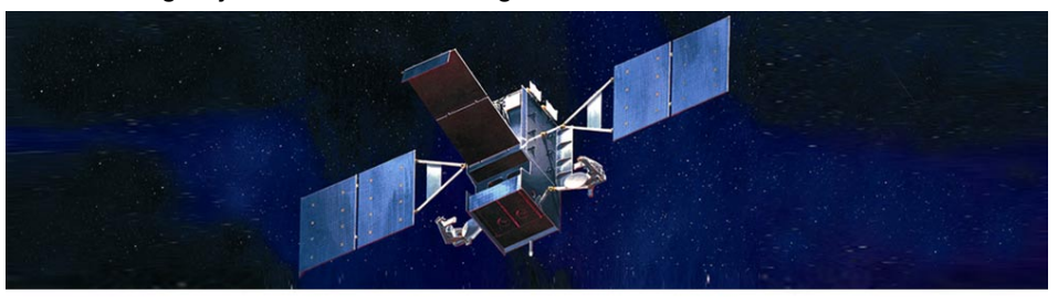
Illustration of geosynchronous earth-orbiting satellite

However, the restructuring did not fully address some long-standing problems identified by the Independent Review Team. As a result, the program continues to be at substantial risk of cost and schedule increases. Key among the problems is the program's history of moving forward without sufficient knowledge to ensure that the product design is stable and meets performance requirements and that adequate resources are available. For example, a year before the restructuring, the program passed its critical design review with only 50 percent of its design drawings completed, compared to 90 percent as recommended by best practices. Consequently, several design modifications were necessary, including 39 to the first of two infrared sensors to reduce excessive noise created by electromagnetic interference—a threat to the host satellite's functionality—delaying delivery of the sensor by 10 months or more. Software development underlies most of the top 10 program risks, according to the contractor and the SBIRS High Program Office. For example, testing of the first infrared sensor revealed several deficiencies in the flight software involving the sensor's ability to maintain earth coverage and track missiles while orbiting the earth. Program officials stated that they are coordinating the delivery of the first sensor with the delivery of the host satellite to mitigate any schedule impacts, but they agreed that these delays put the remaining SBIRS High schedule at risk.