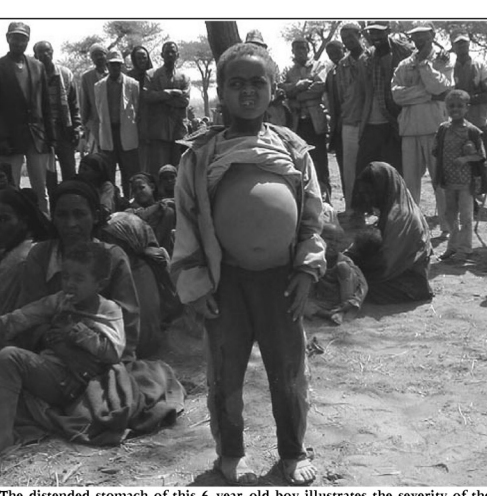
The distended stomach of this 6-year-old boy illustrates the severity of the hunger problem in Ethiopia. 11 million Ethiopians are at risk.

By Easter, thousands of Ethiopians could be dead from starvation. Children living in villages just 90 miles from the capital city, Addis Ababa, which is easily accessible by