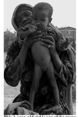
This 3-year-old girl is one of the many starving Ethiopian children.

Fortunately, relief organizations, including U.S. AID and the United Nations World Food Programme, have developed an early warning system to better predict the effects of the looming crisis and have been sounding the alarm since the fall.