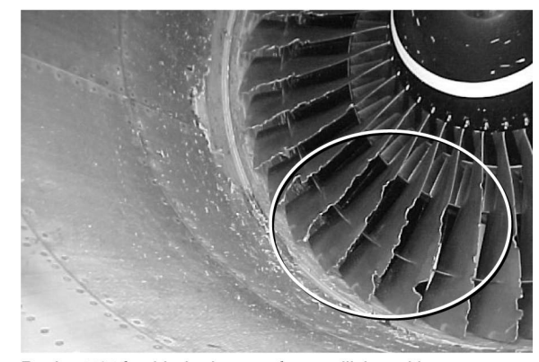
Boeing 747 fan blade damage from collision with a Western gull.