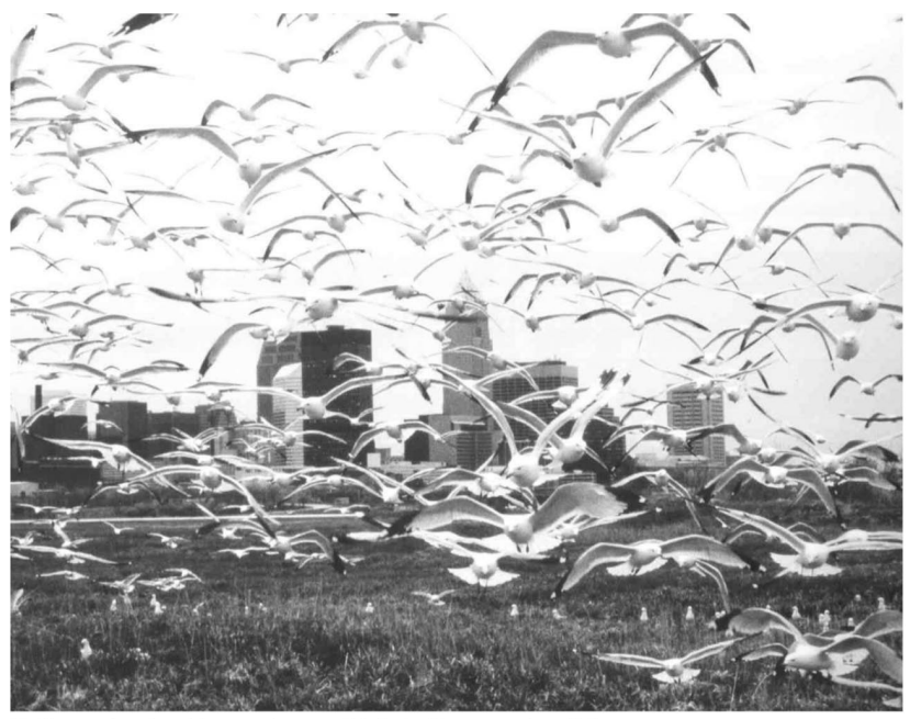
Gulls are involved in nearly one-third of all reported collisions.