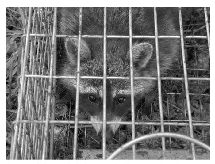
A raccoon is trapped for testing as part of the program's rabies control work in Ohio.