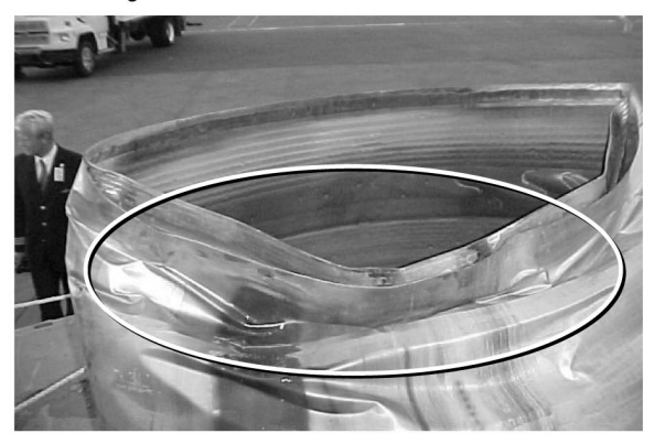
Boeing 747 exhaust nozzle damage from collision with a Western gull.