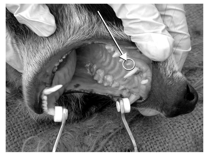
The first pre-molar is pulled and tested for tetracycline (indicating consumption of rabies vaccine bait).