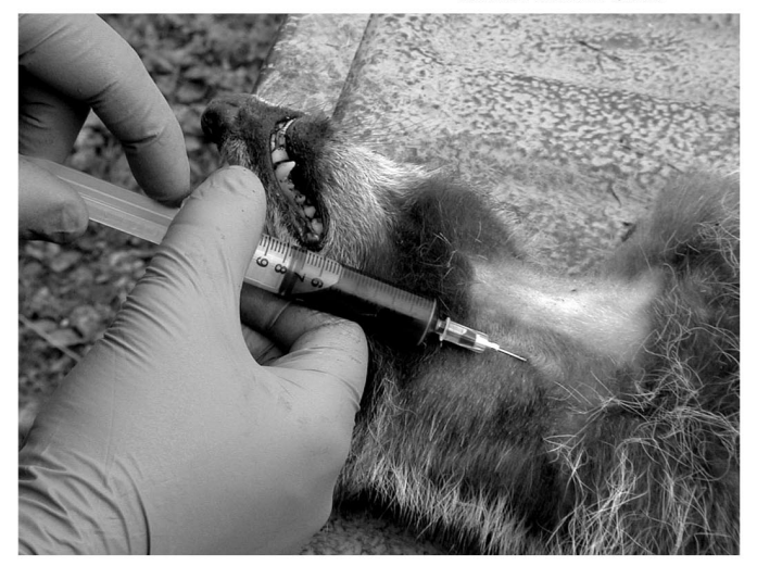
Blood is drawn and tested for rabies antibodies.