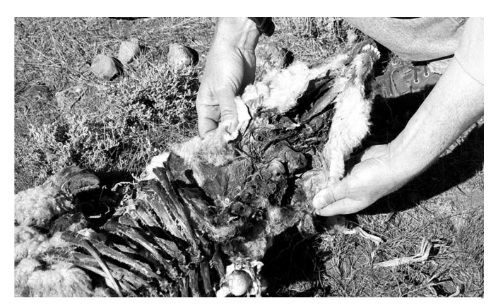
Wildlife Services officials can tell that this lamb was killed by a coyote.

Sources: Coyotes attacking lamb, USDA; lamb carcass, GAO.