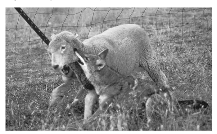
Figure 1: Coyotes Are Responsible for Most Lamb Losses to Predators