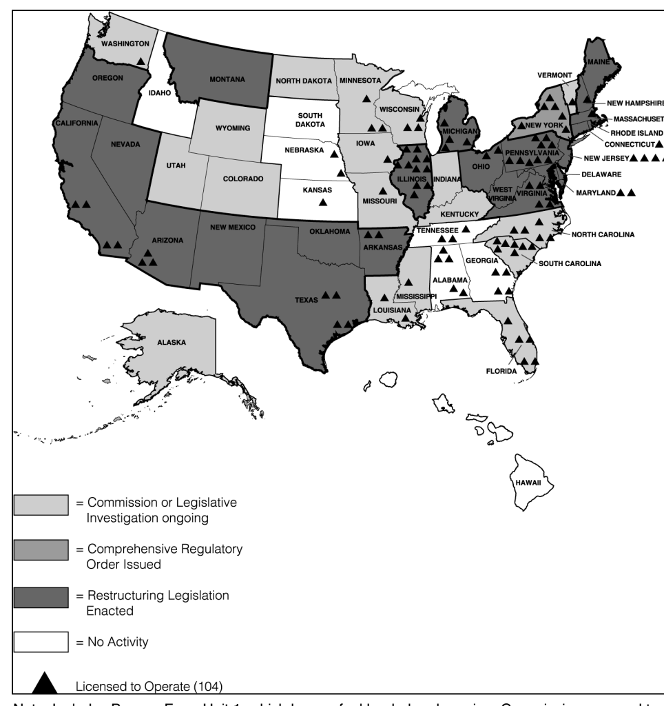
Figure 2: Map of Nuclear Power Plants in the United States and Status of Deregulation by State

Note: Includes Browns Ferry Unit 1, which has no fuel loaded and requires Commission approval to restart.