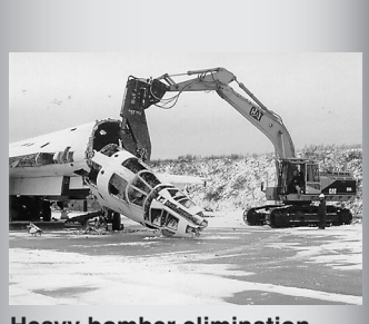
Heavy bomber elimination