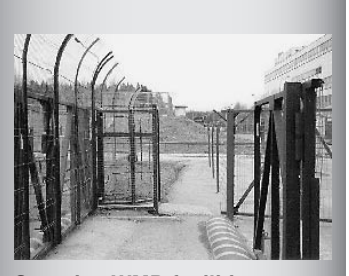
Securing WMD facilities