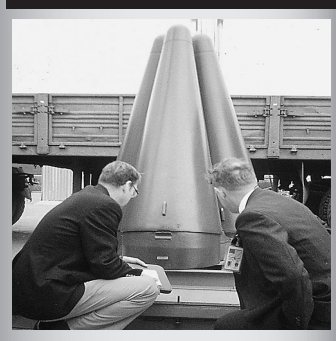
Inspecting nuclear warheads