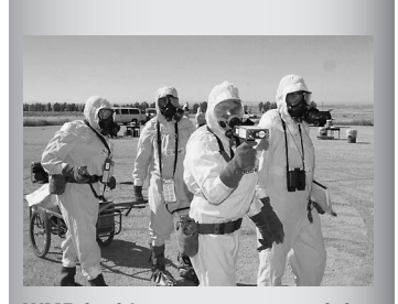
WMD incidence response training