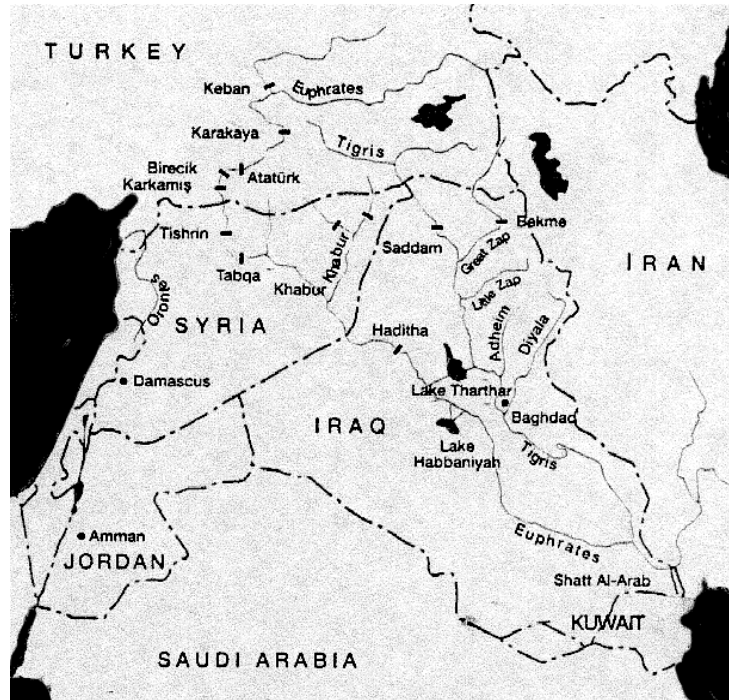
Map of the Tigris-Euphrates river basin 6

AD 1258, it was, however, only in the nineteenth century that an effective return to large-scale irrigation run by central governments took place. The Tigris and Euphrates did not officially become international rivers until the collapse of the Ottoman Empire after World War I. The idea of GAP can be dated back to Mustafa Kemal Ataturk, the founder of modern Turkey, referring to “developing the Euphrates as a lake of humanity.” 7 The initial aim was to harness water as a source of electrical power and multifarious surveys were carried out between the 1930s and 1970s, which also identified the potential for irrigation. In 1977, all projects were merged under the title “GAP.”