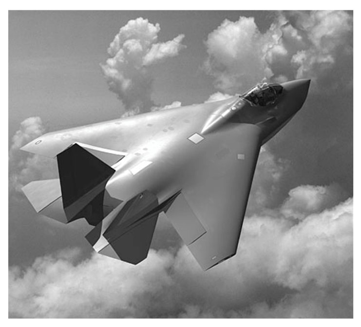
Figure 1: Boeing and Lockheed Martin Joint Strike Fighter Aircraft Design Concepts