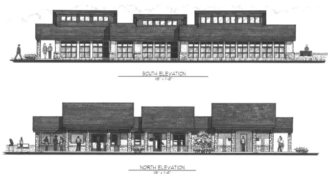
A rendering of the south and north façades of the planned new Pinnacles National Monument Visitor Center in California

Pinnacles National Monument is part of the U.S. National Park system. It is in the California coastal range, about 100 miles southeast of San Francisco. A Presidential Proclamation established the monument in 1908 to preserve its unique volcanic formations. Visitors enjoy hiking, rock climbing, and picnicking, primarily in spring and fall. In 2000, the monument hosted more than 200,000 visitors.