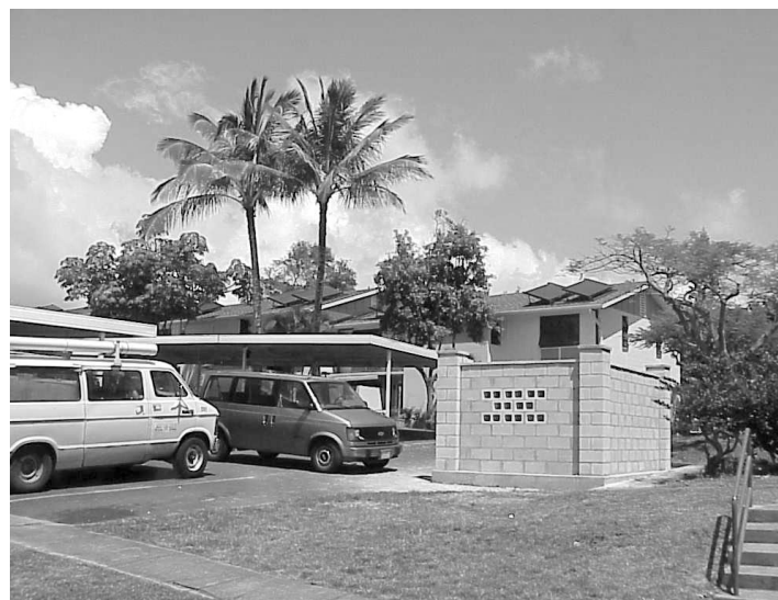
This Coast Guard housing at Kia'i Kai Hale near Honolulu, Hawaii, is one of several complexes featuring solar water heating.

Imported oil supplies 89 percent of Hawaii's energy needs; no other state in the nation is so critically dependent on imported petroleum. Unlike mainland states, Hawaii can't readily turn to its neighbors for help during temporary or permanent power shortages. So, Hawaii is actively developing renewable energy resources through tax incentives, a renewable portfolio standard, net metering, mandates for state buildings, educational programs, and partnerships with the federal government.