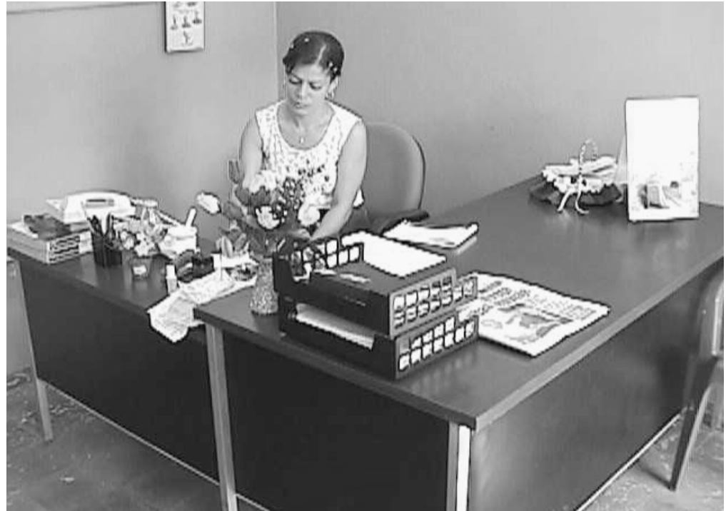
Figure 2: Furniture Used for the Offices of the Youth Center in Cristo Rey, Santo Domingo