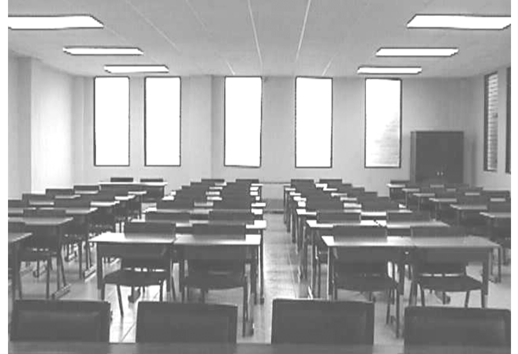
Figure 3: Desks for a Classroom in the Salesian Mission's Provincial House in Santo Domingo