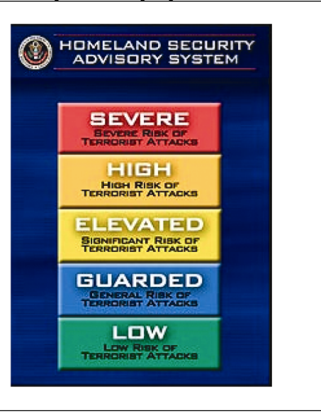
Figure 1: Homeland Security Advisory System