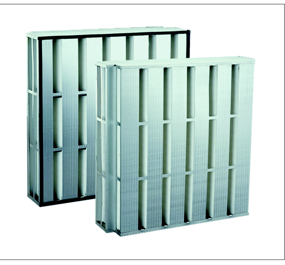
Figure 3: A Typical HEPA Filter for Commercial Passenger Aircraft