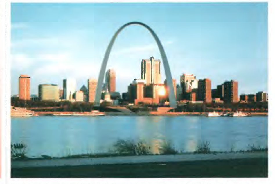
The dramatic Gateway Arch in St. Louis, Missouri, towers over the gentle landscape of the central Mississippi Valley. In the past, this region has been struck by very powerful earthquakes. The geologic structures related to the causes of earthquakes in the region are buried by deep sedimentary deposits. Using geophysical techniques, U.S. Geological Survey scientists are revealing these hidden earthquake hazards.

and created Reelfoot Lake, which covers an area of more than 10 square miles in northwestern Tennessee.