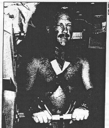
Exercise on the treadmill has been a part of the crew health regime from the early days of the shuttle program. Here, Rick Hauck is photographed exercising on the treadmill on the Challenger's mid-deck during STS-7.