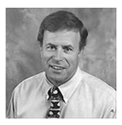
Donald Pickrell is DOT's Volpe Center's Chief Economist.

I generally advocate that benefit-cost analysis should not over concretize the benefits . We all tend to use ourselves as examples. While this can keep us connected with the real world, it is a little dangerous. We tend to make decisions more concrete to a particular situation—yours, your daughter's, etc. In fact, these decisions are likely to be altered and to affect circumstances in many ways that might not be immediately obvious.