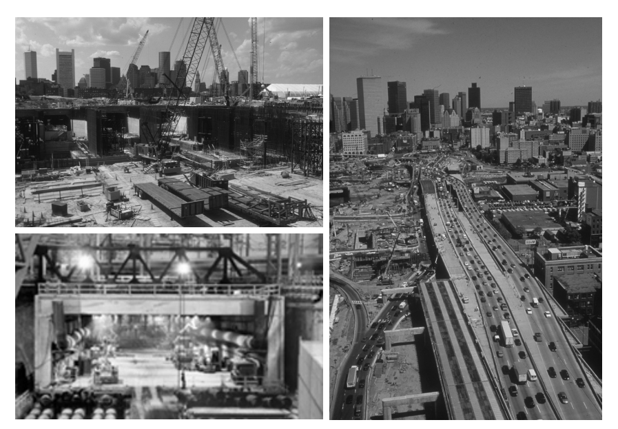
Figure 3: Boston's Central Artery/Tunnel Project