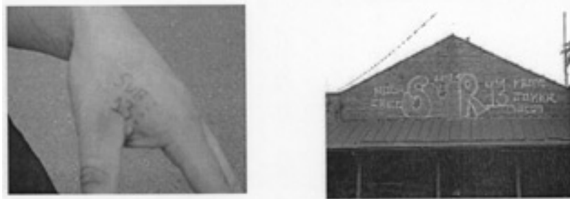
The photographs below depict recent taggings on well known MS-13 Turf.