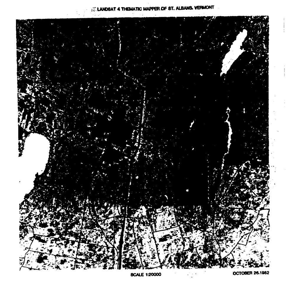
Figure 1. Classified Thematic Mapper data image of St. Albans, Vermont region that has been enhanced by the incorporation of a digitized composite transportation and urban land cover layer to create a land use data layer.