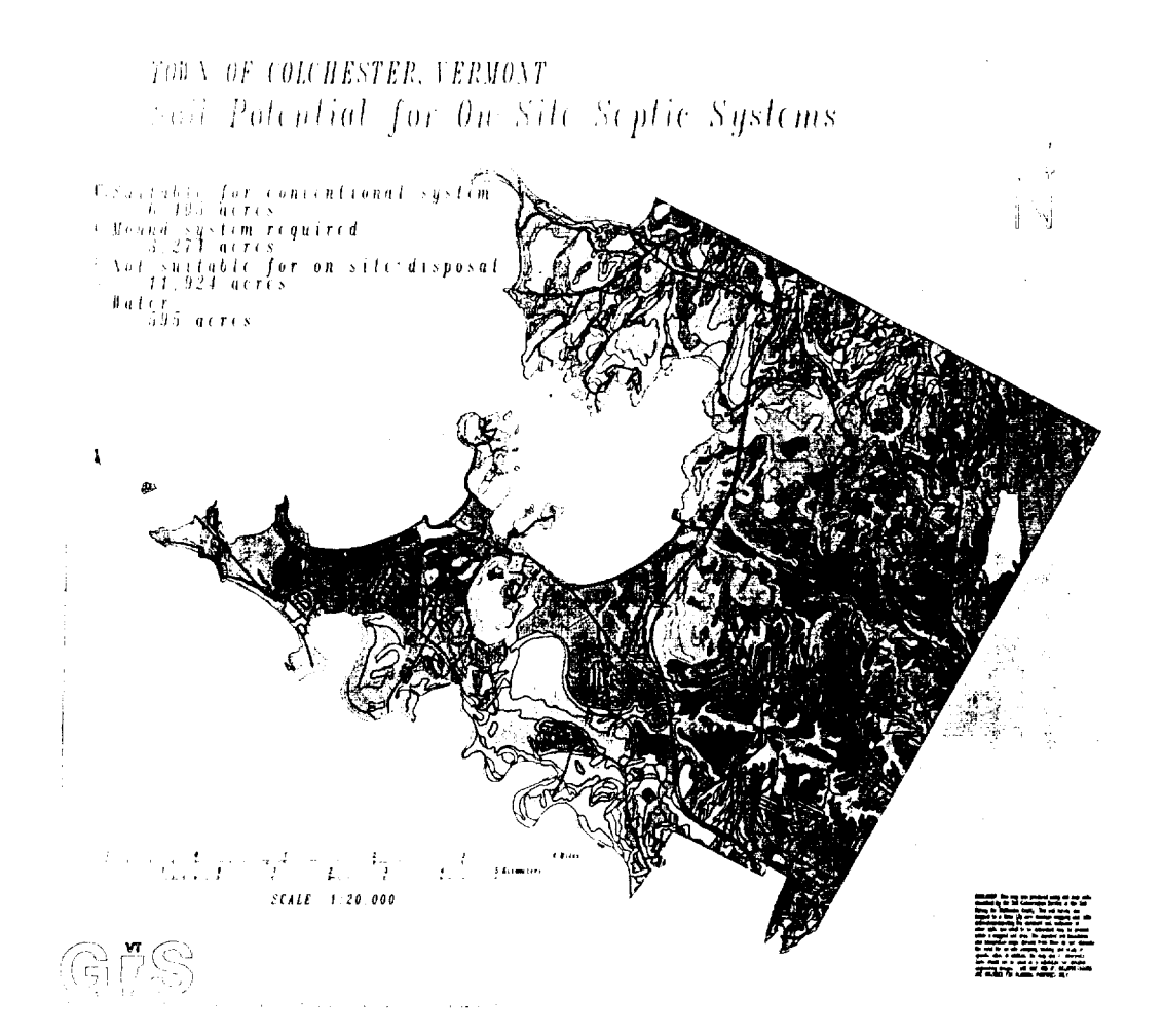
Figure 4. On-site sewage disposal capability for the Town of Colchester, Vermont. This illustrates one type of soil interpretation that can be accomplished using the SOI-5 soils data base.