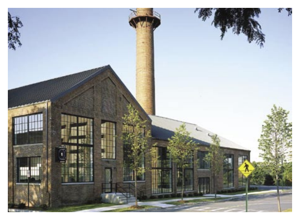
Modern updates to historic buildings make office space in Watertown Arsenal enticing.

After 200 years as a cannon and armament manufacturing facility, the former Watertown Arsenal in Massachusetts closed in 1995. It is now an office and manufacturing center, with a mix of restaurants, retail, childcare centers, sports facilities, and pedestrian and bicycling trails. The historic brick buildings that house the new development create a unique and appealing setting. The renovation preserved the structures' architectural integrity while modernizing every building, including rewiring them with fiber-optic cables so all tenants could have internet access.