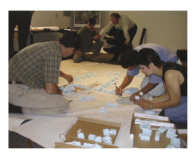
Participants use drawings, maps, and building-shaped blocks to envision the future layout of Baldwin Park.

When growth comes, communities must balance the impacts of the new development while preserving and enhancing the best aspects of their neighborhoods and regions. Growth brings investment, along with new residents and new workers who need transportation options, homes, stores, services, and other amenities. The communities that have used that investment to their advantage—giving residents new amenities, more housing and transportation choices, and more convenience—typically employ a similar set of techniques. These techniques, often referred to as smart growth, have been distilled into ten principles reflecting the experiences of successful communities around the nation. Smart growth practices help ensure that development improves the economy, community, public health, and the environment.