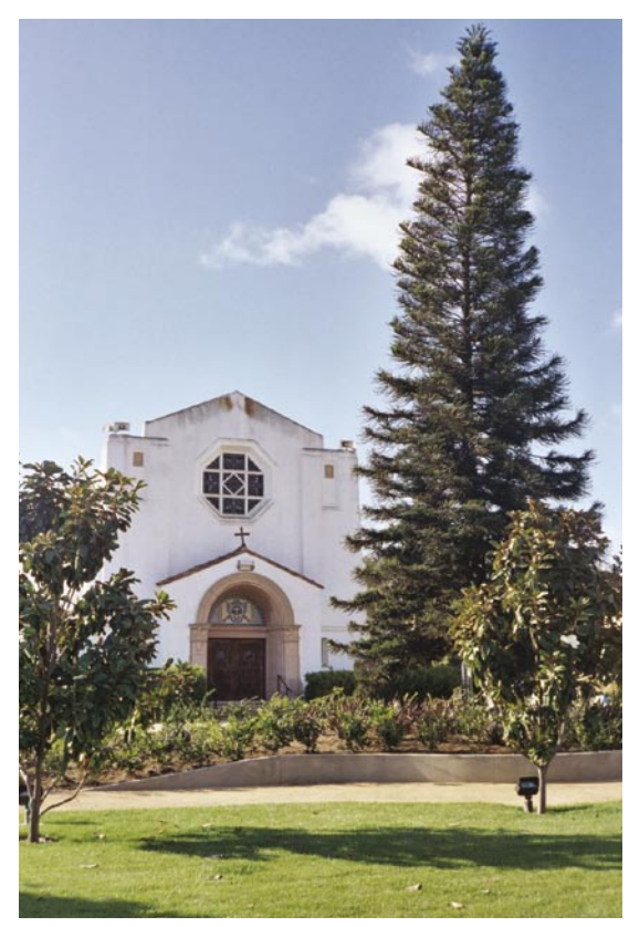
Preserving the unique architecture on the former base.

Web sites: www.sandiego.gov/ntc and www.libertystation.com.