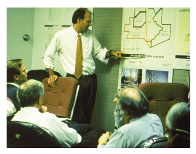
Planning for redevelopment at the former Lowry Air Force Base.

Having a military base close or reduce operations can be traumatic for its host community. The future is uncertain—residents worry about losing jobs and declining property values, local business owners fear a devastating impact, and people are concerned about environmental contamination on the base. The challenges may seem daunting, but many communities have transformed former bases into valuable assets. Indeed, many of these redevelopments have become showplaces for the entire region—boosting the economy, creating jobs, providing homes, and protecting the environment.