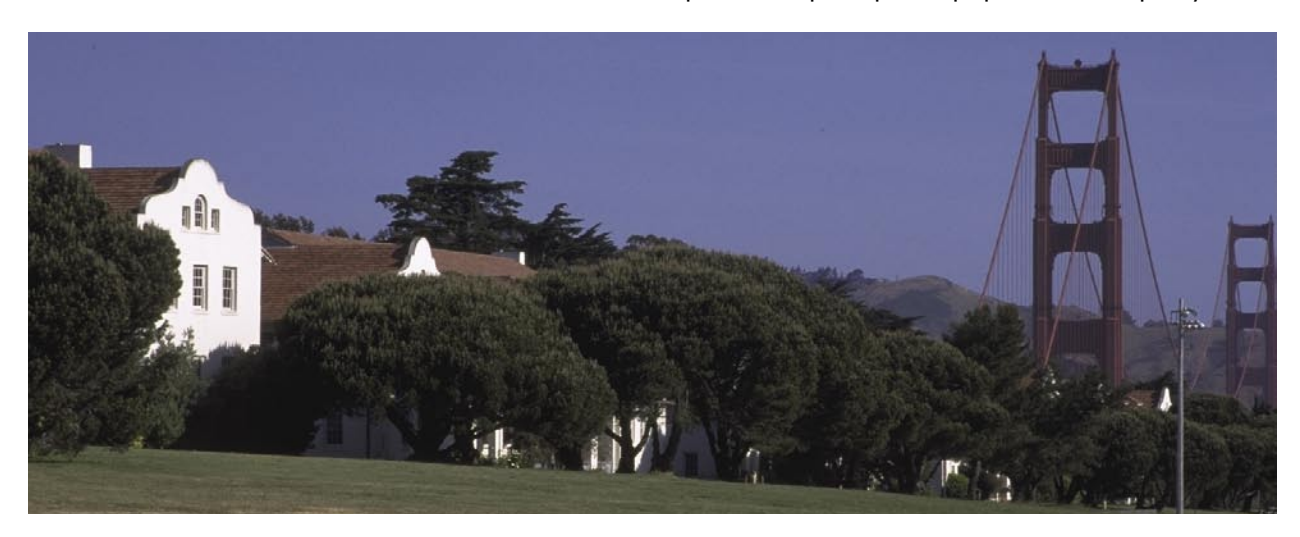
The Presidio's dramatic location and historic buildings make it attractive to residents and businesses.

These strategies are good for the environment and public health too. With destinations closer together in a walkable neighborhood, people can choose whether to walk, bike, take transit, or drive. Having these options means less air pollution from cars and trucks, as well as less traffic on the roads. In addition, compact, well-planned development results in less paved area per capita because it has smaller-scale parking lots and roads. Because runoff from paved surfaces is a major source of water pollution, reducing the amount of paved area per capita helps protect water quality.