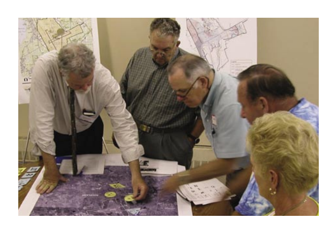
Residents of the surrounding towns participate in developing the plan for South Weymouth.

Many tools are available to help the LRA and local governments educate the public about the benefits of a compact and well-designed redevelopment, solicit community input on the design, and clearly envision the kind of development the community wants. A visual preference survey, for example, shows images of different development types and asks the participants to rank them by preference. Software tools compare different redevelopment options based on the amenities each provides, the traffic each generates, the water each consumes, and the proximity of households to parks and transit. Public participation workshops, including design charrettes, are very effective and help develop a plan that is economically feasible and that the community supports. For more information on these and other tools, see the Resources appendix.