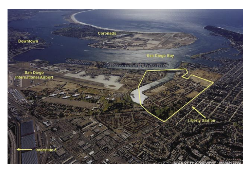
Liberty Station occupies a prime location near downtown San Diego.

million worth of infrastructure improvements, including sewer, water, electric, cable, phone and storm-drain system improvements, new parking areas, and new road and traffic improvements to internal and surrounding streets. Road improvements include new curbed medians, renovated sidewalks, bike lanes,