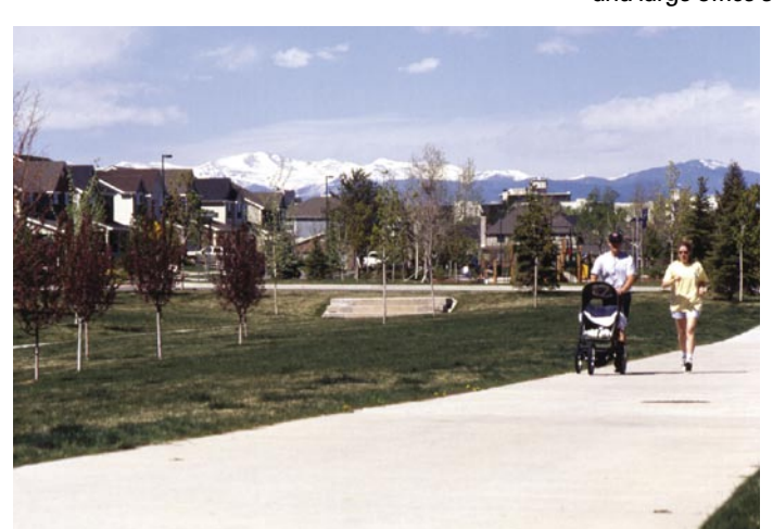
Trails connect homes to parks, libraries, and other amenities.

During the reuse planning, Lowry promised residents a wide spectrum of housing choices. Currently, the site has approximately 3,000 homes and apartments ranging in price from $115,000 to $2 million. To ensure that