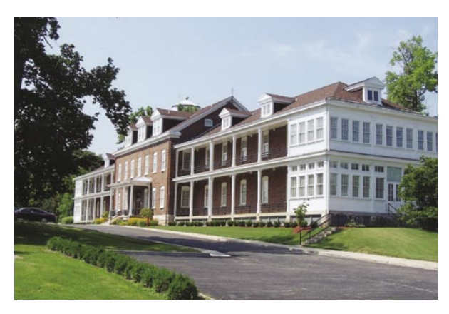
This historic building on the former Fort Benjamin Harrison has been converted into the Kendall Inn, a 28-room boutique hotel.

land trust and DoD to pursue this option. Siting new development to protect important natural resources will make it easier to get the necessary development permits from local, state, or federal agencies.