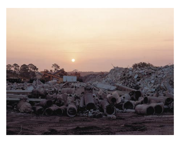
256 buildings, 200 miles of underground utilities, and 25 miles of road were demolished and recycled for the development of Baldwin Park.

Knowing the type and location of contaminants will greatly benefit the LRA in formulating base redevelopment options and making future land use determinations that appropriately take contamination and cleanup options into consideration. Many installations have a Restoration Advisory Board (RAB) comprised of representatives from the community, the military installation, local government, and regulatory agencies. The RAB members provide input to the installation about its cleanup program, activities, and decisions. If an RAB exists at the base, the LRA and RAB members should communicate regularly to ensure that the base reuse plan and the cleanup strategy schedules are in accord. Additionally, the LRA should discuss past, ongoing, and planned cleanup efforts with DoD and the environmental regulators to ensure that the base cleanup and reuse planning/redevelopment timelines are coordinated and synchronized, if possible. This coordination can be more efficient, saving the community time and money.