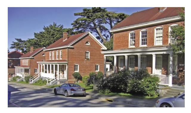
The Presidio provides much-needed housing.

Many bases have large, undisturbed natural areas that can continue to provide great habitat for fish and wildlife and recreational space for people. In other cases, some tracts are best left undeveloped because of contamination that makes them unsuitable or unsafe for human use. The community should be able to get information from the base and from federal and state agencies on natural resources such as wetlands, streams, flood plains, and fish and wildlife habitat. A conservation easement or conservation conveyance can preserve some or all of these lands in perpetuity if the community desires. The LRA can consult with a