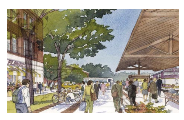
The proposed development around the commuter rail station at South Weymouth.

and some communities have offered developers incentives to balance the added expense. The city of San Diego gave Liberty Station's developer a ground lease on almost 200 acres of land to compensate for the cost of demolishing and replacing the base's infrastructure. The Glen, the mixed-use redevelopment of the former Glenview Naval Air Station in Illinois, covered its infrastructure replacement costs with revenues from land sales and property taxes. Many base redevelopments, including Liberty Station and Baldwin Park, recycled the demolished material into new roads and other infrastructure, saving money and conserving resources.