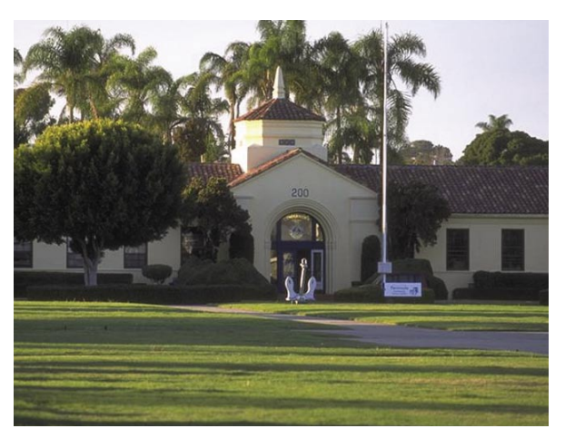
The historic buildings at the former Naval Training Center in San Diego are being restored and reused.

Sometimes closed bases languish for years, their buildings falling into disrepair as developers or local governments squabble over reuse plans. The city of San Diego found one innovative idea for keeping the buildings in use. The Navy closed its Naval Training Center on San Diego Bay incrementally over 4 years. During that time, the city leased base buildings from the Navy and then subleased them to other entities. This arrangement kept the buildings occupied and in good repair until the city officially took over the property. Other bases awaiting redevelopment, including South Weymouth Naval Air Station, have used similar leasing arrangements. Communities will need to review current regulations and work with DoD to determine where and under what circumstances leasing arrangements are possible.