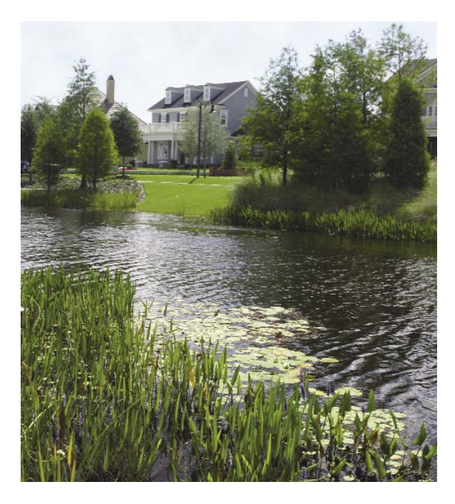
The Baldwin Park Development Company set aside 468 acres as protected wetlands, lakes, and park land.

The city received the base from the federal government and transferred it to a private developer, chosen through a competition, who renamed the parcel Baldwin Park. The developer paid $7.6 million for 1,093 acres: 90 acres went to the federal and state governments for government offices and 468 acres were protected wetlands, lakes, and land set aside for parks, leaving 535 developable acres for more than 4,000 homes, 1 million square feet of offices and stores, a new elementary school, a new middle school, a church, and three community centers. The developer also paid $1.7 million to cover additional cleanup costs. The city offered the developer a loan and a line of credit to help with demolition, environmental remediation, and construction, and a $13.5 million impact-fee credit based on what the Navy had spent on the base's infrastructure.xiv As the planning and building proceed, the city holds monthly public meetings in cooperation with the developer, and the Navy monitors environmental conditions at the site.