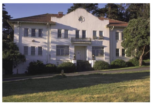
The Presidio's architecture spans centuries, making it a unique destination.