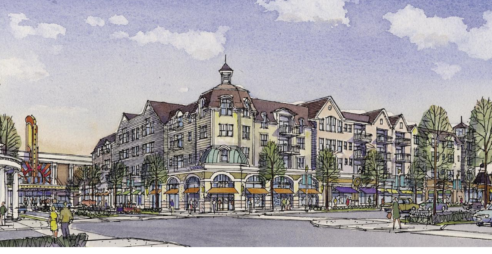
A new neighborhood planned for the former Myrtle Beach Air Force Base.

Several military base reuse projects have explicitly used smart growth techniques to plan redevelopment. The former Lowry Air Force Base outside of Denver is now a flourishing community that preserves its military history and honors its heritage as a training center with several educational institutions. It also has homes, shops, offices, and parks, all of which are welcome additions to the surrounding neighborhoods. Orlando's former Naval Training Center has become Baldwin Park, an award-winning neighborhood that truly feels like a community, with new, much-needed homes, ecologically important habitat, shopping, and offices—all just 2 miles from downtown Orlando. The transformation of the former Naval Training Center into Liberty Station reopened the San Diego Bay waterfront to the public for the first time in more than 80 years, and it preserved beautiful historic buildings while adding new houses, offices, stores, and arts facilities. This guidebook describes the smart growth techniques used in these and other successful base redevelopments to help communities with newly closed or partially closed bases chart a vibrant, new future.