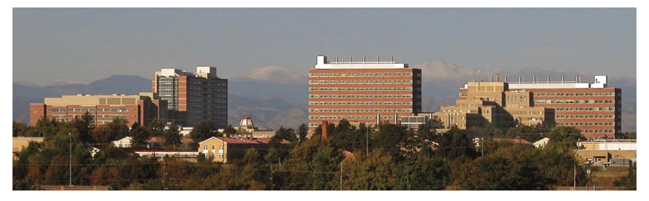
Fitzsimons is home to a world-class health sciences campus with hospitals, housing, research facilities, and amenities.

Taking advantage of its medical history, the former Fitzsimons Army Medical Center in Aurora, Colorado, is redeveloping into a world-class health sciences campus and biotechnology research park. The University of Colorado's Health Sciences Center, with its attendant hospitals, specialty medical institutes, and laboratories, has led the way, bringing a projected 19,000 jobs to the site by 2010. At completion, the site will have a town center with retail and 400 to 600 homes, as well as a police station and hotel. For more information, see <a href="https://www.colobio.com/index.html">www.colobio.com/index.html</a>.