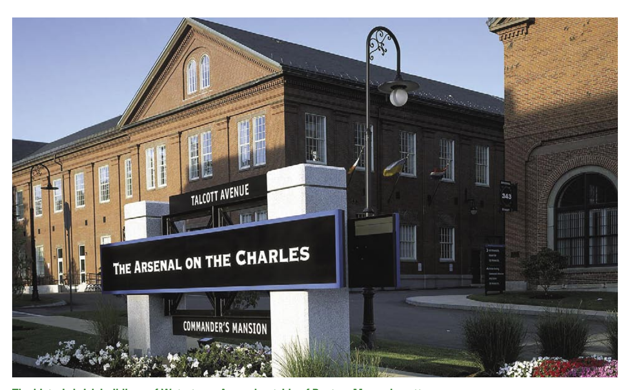
The historic brick buildings of Watertown Arsenal outside of Boston, Massachusetts.

Remember, base closure is a community issue: Base closure is more than a real estate transaction; it is about people, their jobs, and a way of life—it is a true community issue. Planning for life after closure must be a community-driven process."