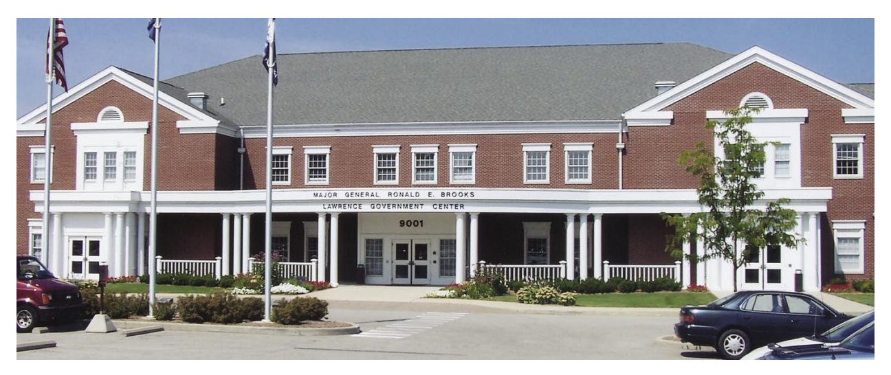
The Lawrence Government Center at the former Fort Benjamin Harrison was built under the architectural guidelines.