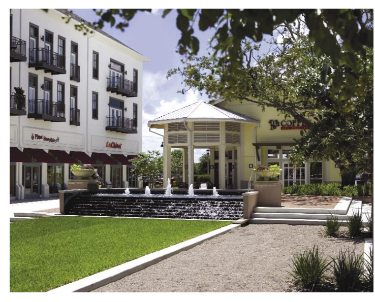
Neighborhood shops and services are convenient for Baldwin Park residents.

The city notes that "Baldwin Park is what the citizens of Orlando ask for: quality homes; a mixture of uses with businesses, schools, residences, and recreation contained within one community; job creation and tax generation." The development has won national recognition with awards such as EPA's National Award for Smart Growth Achievement (2005), Urban Land Institute's Award of Excellence (2004), the National Arbor Day Foundation's "National Building with Trees Award of Excellence" (2004), and the Council for Sustainable Florida's "Sustainable Florida Best Practices Award" (2004). The developer won the Distinguished Corporation Award from Audubon of Florida, and one of the architects won a Palladio Award for his design of one of the development's recreation centers.