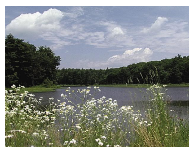
Natural assets create amenities for the entire region surrounding the former Pease Air Force Base.

Some bases occupy very desirable land: a water-front, the center of a growing neighborhood, or property surrounded by parks. Many of the former installations were communities unto themselves, so they often already have golf courses, playing fields, swimming pools, bowling alleys, recreational facilities, and other amenities. The community may decide to restore these facilities during redevelopment or build new ones. The LRA also should consider where it makes sense to continue using facilities like hospitals and schools for appropriate similar civic uses.