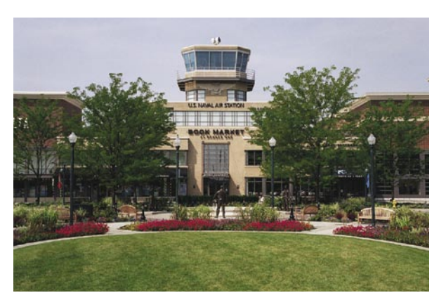
The former control tower was converted into a bookstore at Glenview Naval Air Station.

base is served by roads, as well as by public transit (such as buses, rail lines, or shuttles) and bicycle and pedestrian routes. On the former South Weymouth Naval Air Station, for example, the proposed development will be close to a commuter rail system that runs to and from downtown Boston.