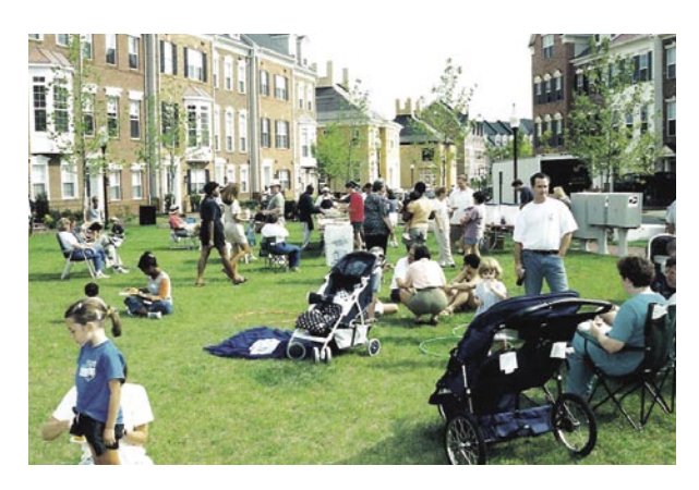
Cameron Station has lots of housing options—townhomes, apartments, and single-family houses, with ample parks for neighbors to enjoy.

income for rent. All full-time employees of organizations located in the Presidio get preference for housing, no matter what their income. Rent for workers making less than area median income is 30 percent of their gross income.<sup>vi</sup>