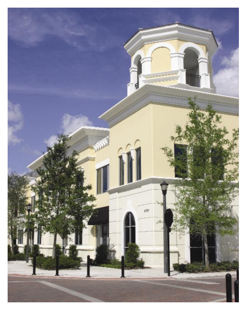
Attractive office space is a critical part of the Baldwin Park project.

Annual tax revenue: $30 million (projected)