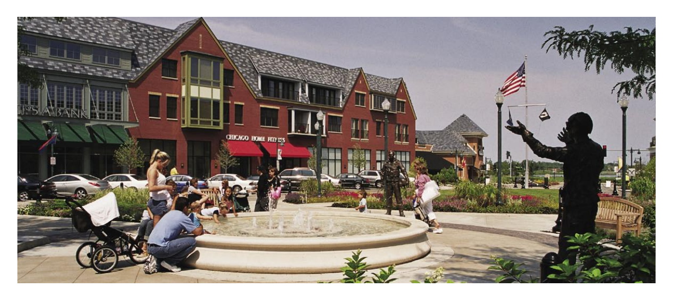
The Glen, formerly Glenview Naval Air Station in Illinois, brings housing, shopping, and entertainment within walking distance of residents.