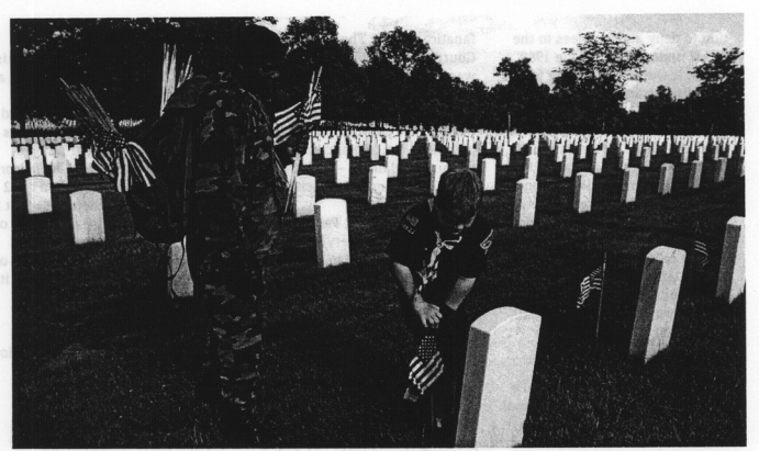
In preparation for Memorial Day, a soldier and a Cub Scout place U.S. flags in front of grave markers at Arlington National Cemetery.