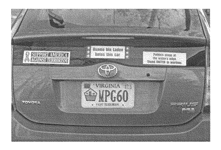
"Politics stops at the water's edge. Stand UNITED in wartime."

I don't think I've ever had a partisan bumper sticker on my car endorsing any specific candidate for federal office. I don't think I'm registered as a member of any political party, and when Senator Chuck Robb was here I repeatedly gave him my vote. But I do have "political" bumper stickers on the back of my 2005 Toyota Prius , and it reads: