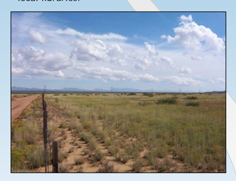
Proposed SRS airfield area, looking southeast

The Draft EIS will be available on the FAA's website and paper copies of the Draft EIS will be available in local libraries.