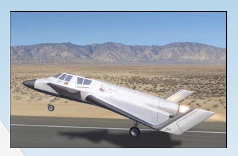
A Concept H2 vehicle is one of three horizontally launched vehicles that will be analyzed in the EIS. Concept H2 vehicles use rocket powered take off and flight and unpowered horizontal landing.