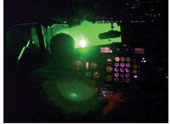
Figure 2: Cockpit glare induced by a 532 nm laser exposure (50 \mu W/cm<sup>2</sup>).

Exposure to light that is several orders of magnitude brighter than that to which the eyes are adapted can reduce or eliminate a pilot's ability to correctly perceive depth or clearly see obstacles and the terrain (Figure 2). The period of time and extent to which these effects may last varies considerably among individuals.