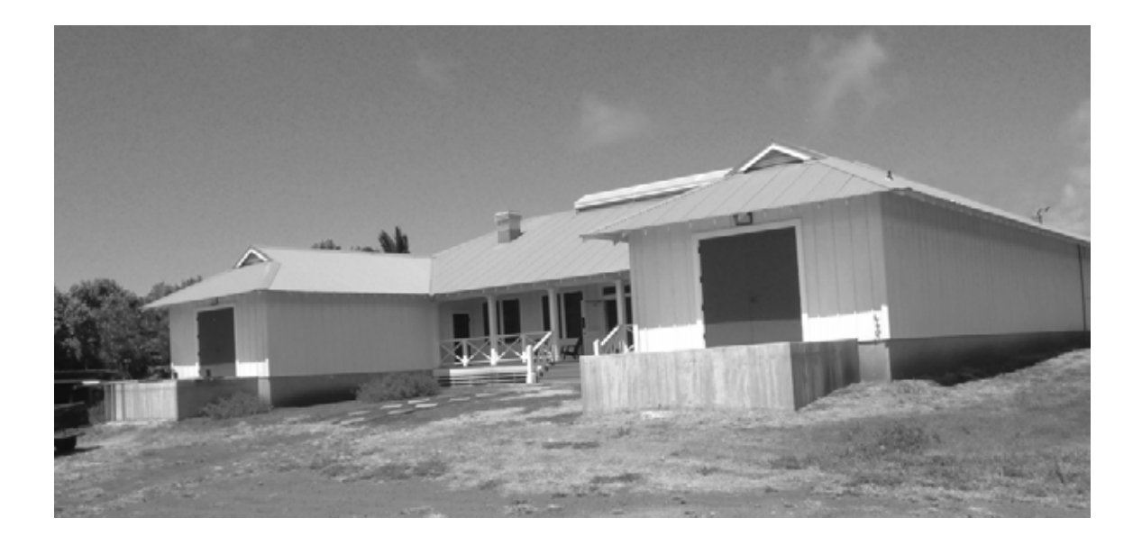
Figure 5 Hale Kalama, curatorial facility