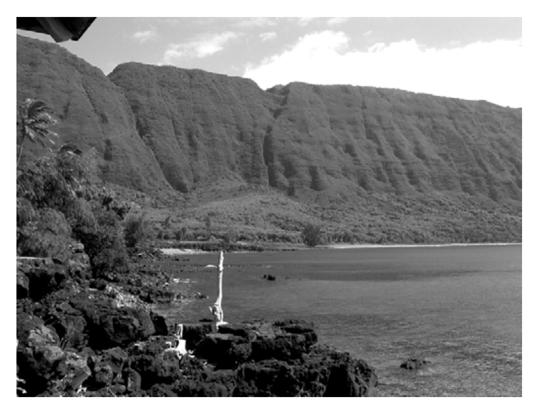
Figure 2 The Pali, 2006