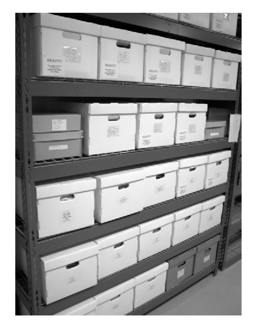
Figure 7 Archival boxes in general storage