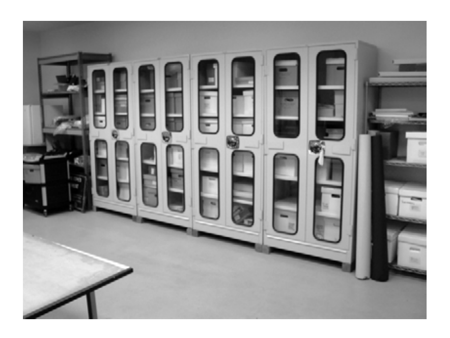
Figure 6 Processing area, south wing of Hale Kalama

Project Management Information System (PMIS) Requests – necessary for identifying both short-term and continuing-project needs.