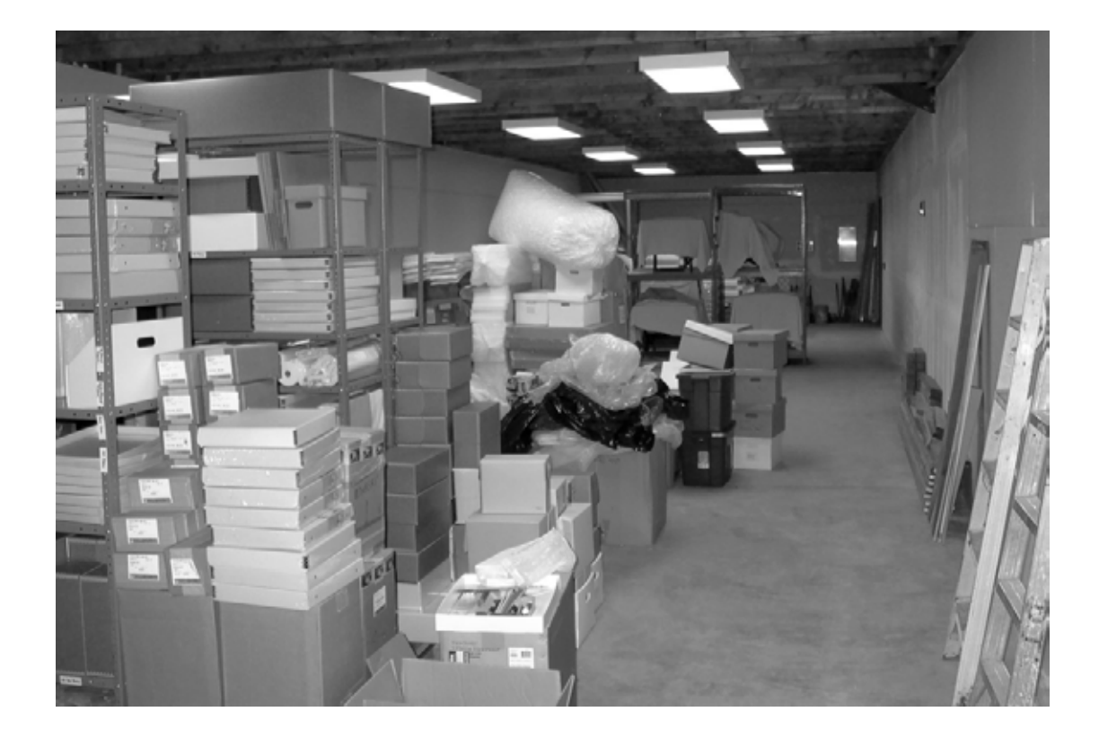
Figure 9 Unfinished storage area in north wing of Hale Malama