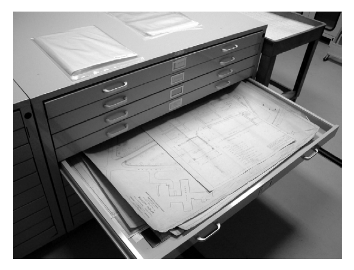
Figure 8 Oversize archives, general storage