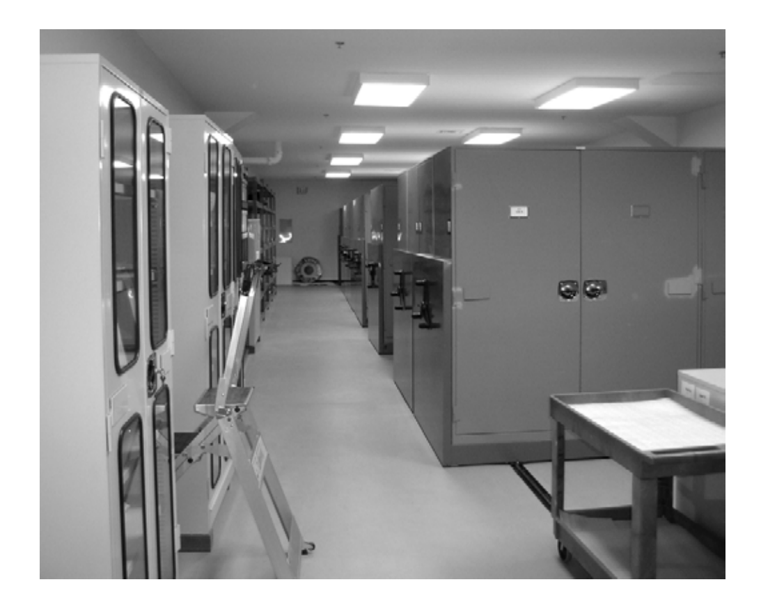
Figure 4 General storage in the south wing of Hale Kalama