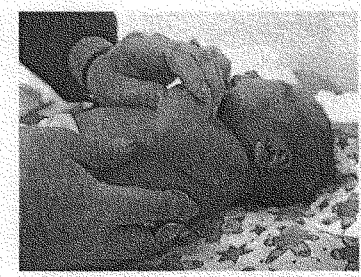
Prenatal, Newborn, and Well-Child Care

In the 1940s and 1950s, the tuberculosis epidemic necessitated sending many people away from their homes and communities for care in sanitariums. With the