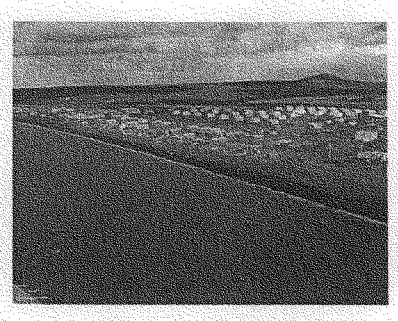
Village of Stebbins in Norton Sound 6 CHA/Ps Serve a Population of 547

Alaska has a total landmass of 586,585 square miles and constitutes one-fifth of the area of the United States (see Figure 1). Within this vast area, approximately 50,000 Alaska Natives live in over 178 villages located as far as 1300 miles from the nearest regional center (2). Ninety percent of the villages in rural Alaska are isolated from each other, separated by tremendous distances, vast mountain ranges, stretches of tundra, glaciers, and impassable river systems. Most of the communities are not connected to a road system. Air transportation is the primary means of travel on a statewide basis. Provision of goods and services and the delivery of health care to these remote sites is always a challenge.