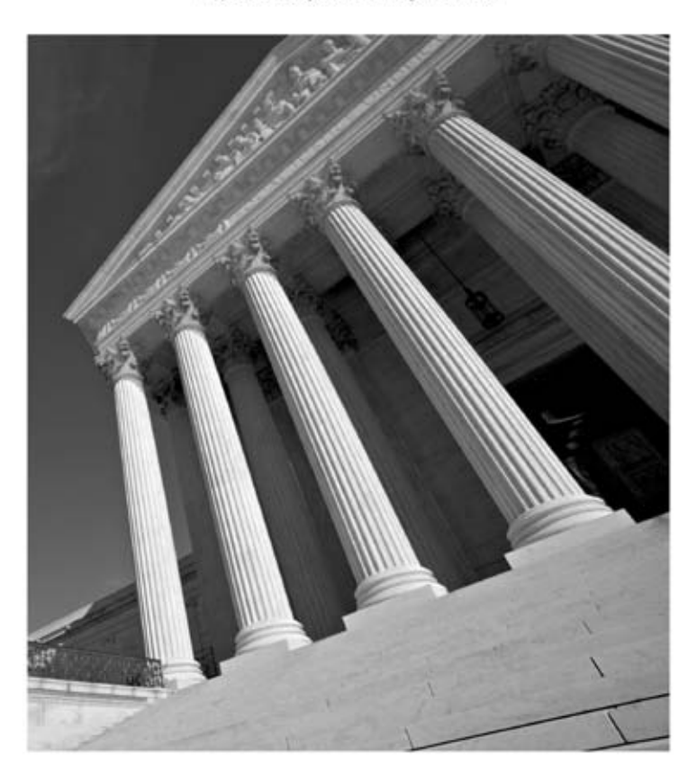
CHAPTER 2 Department of Justice: Civil Rights Division